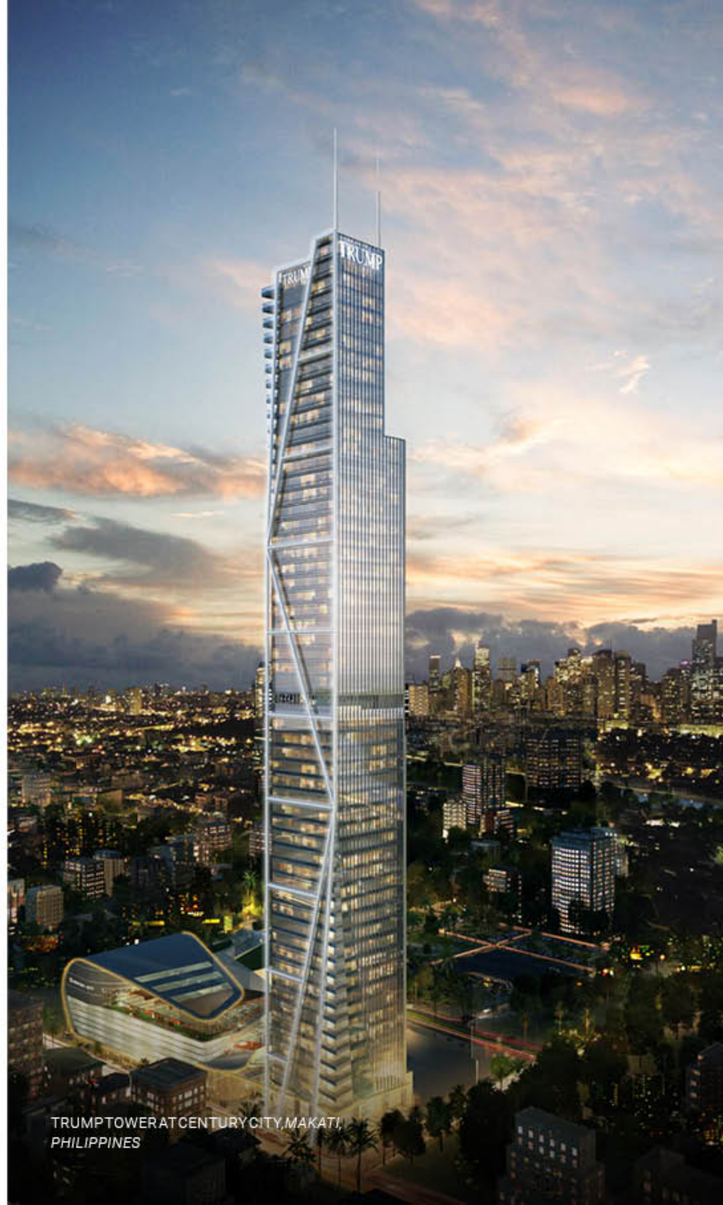
TRUMP TOWER AT CENTURY CITY, MAKATI, PHILIPPINES