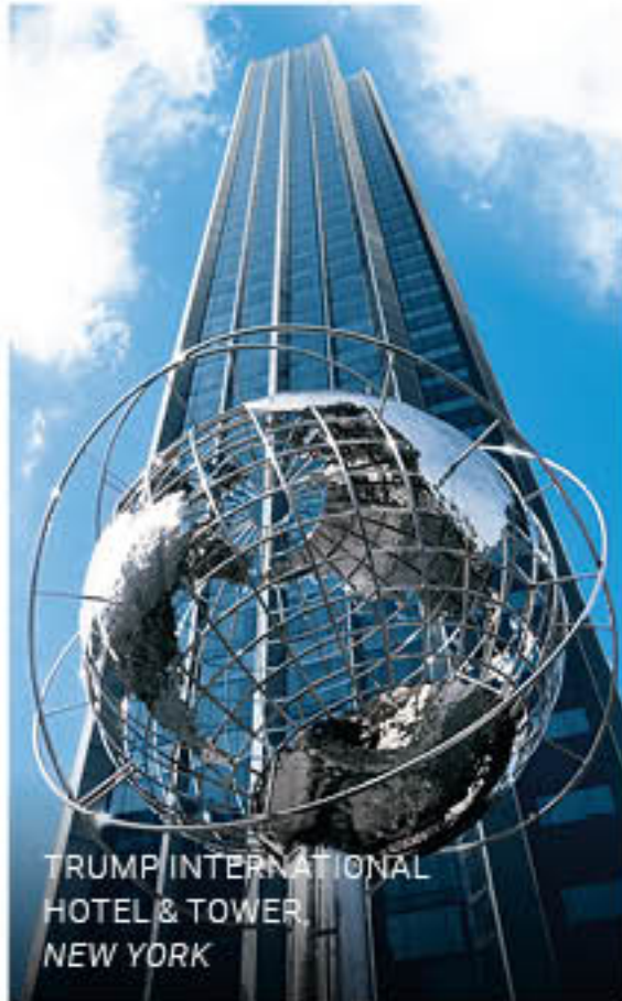
TRUMP INTERNATIONAL HOTEL & TOWER NEW YORK