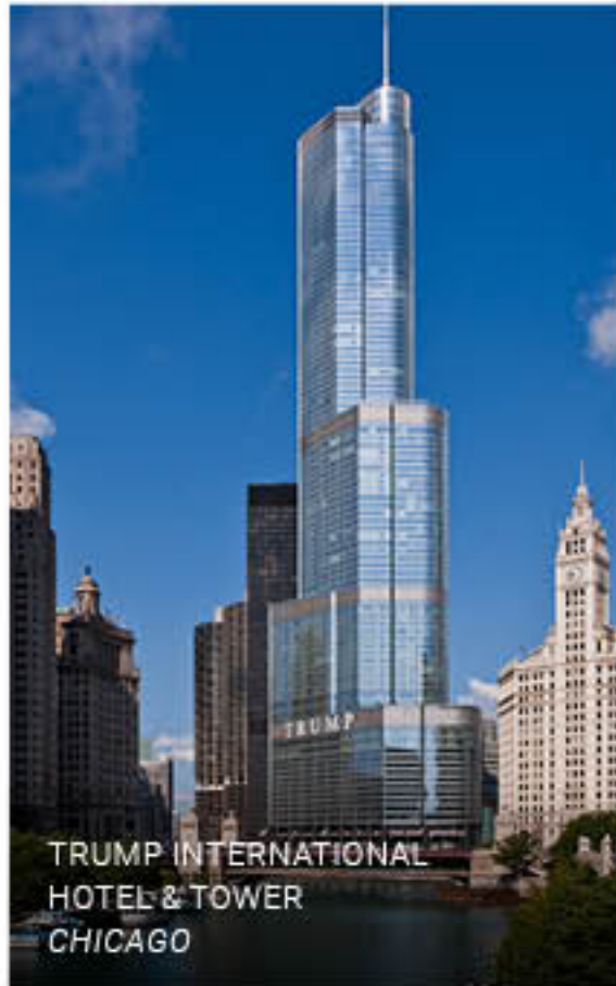
TRUMP INTERNATIONAL HOTEL & TOWER CHICAGO