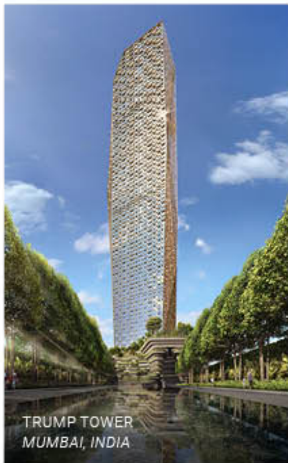
TRUMP TOWER MUMBAI, INDIA