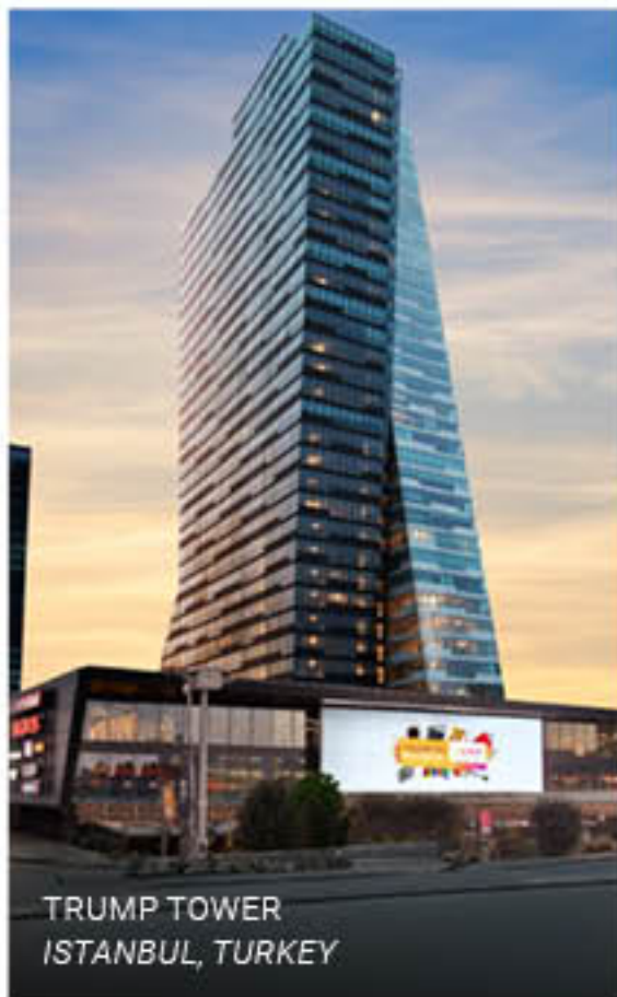
TRUMP TOWER ISTANBUL, TURKEY