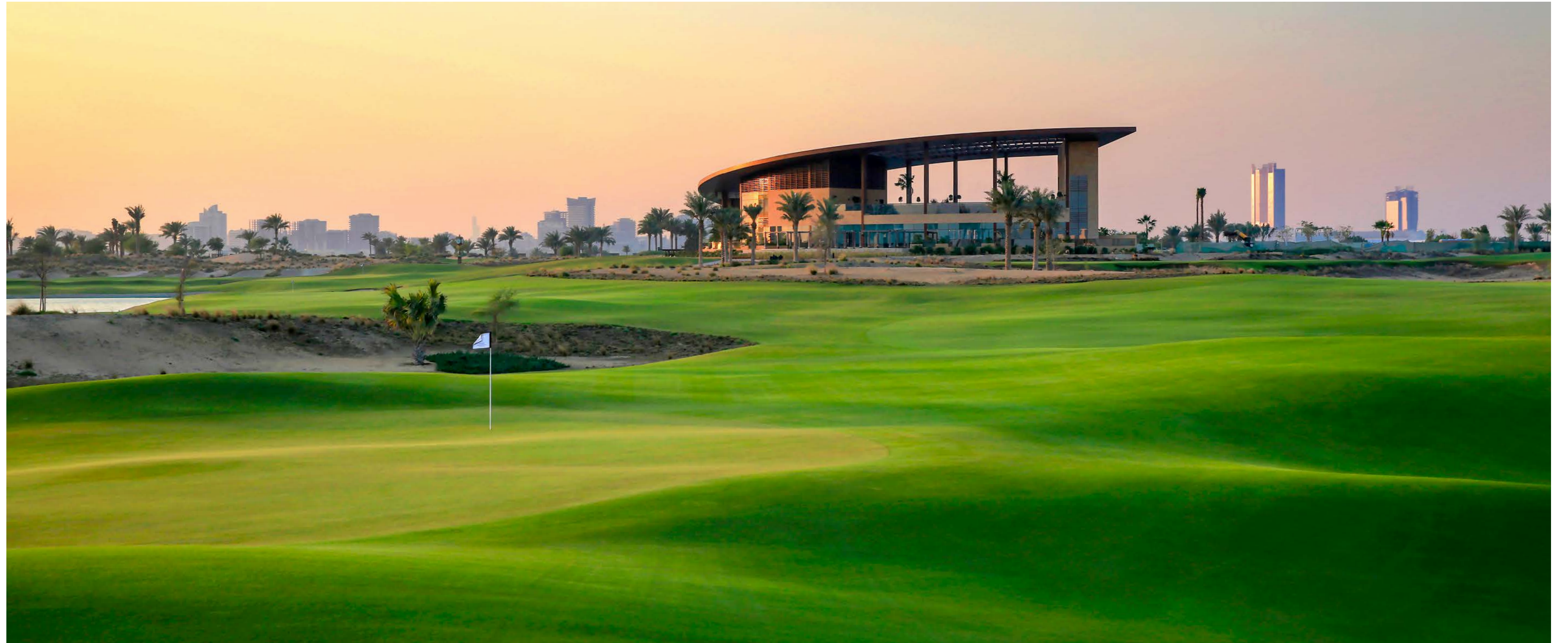
Trump International Golf Club Dubai