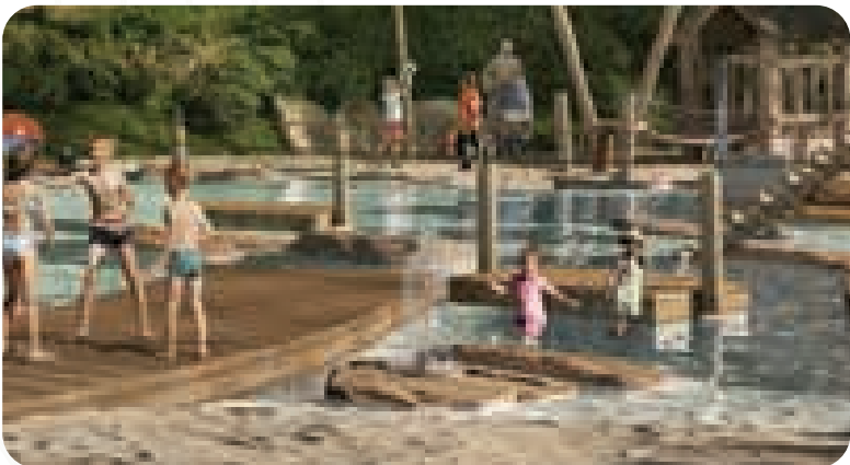
Swimming pools, splash pads and kids' play areas