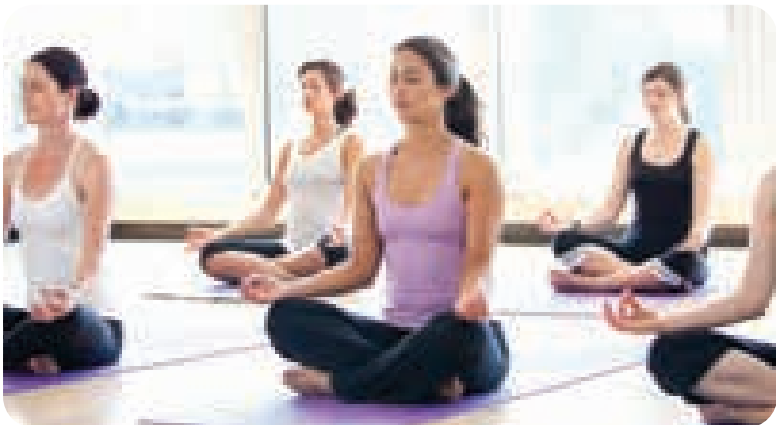
Yoga studio, health & beauty salon, spa, sauna