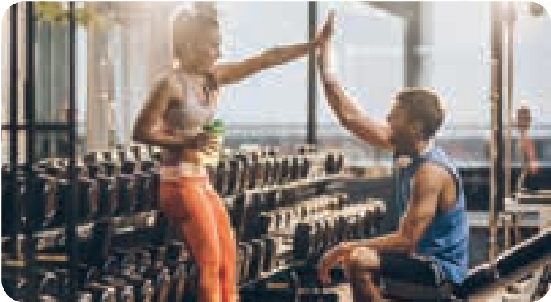
Gyms, outdoor wellness and fitness areas