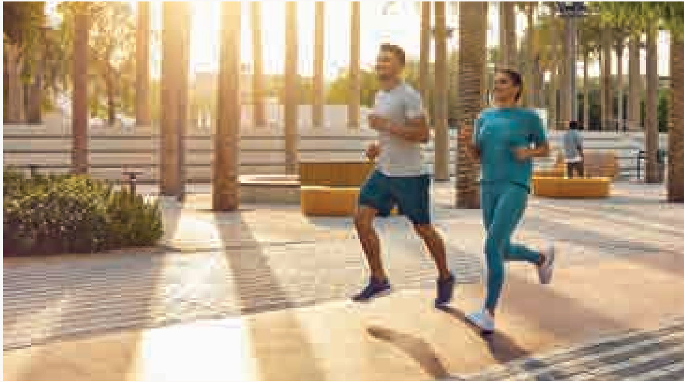
4.5 km of pedestrian tracks and 5.2 km of cycling trails