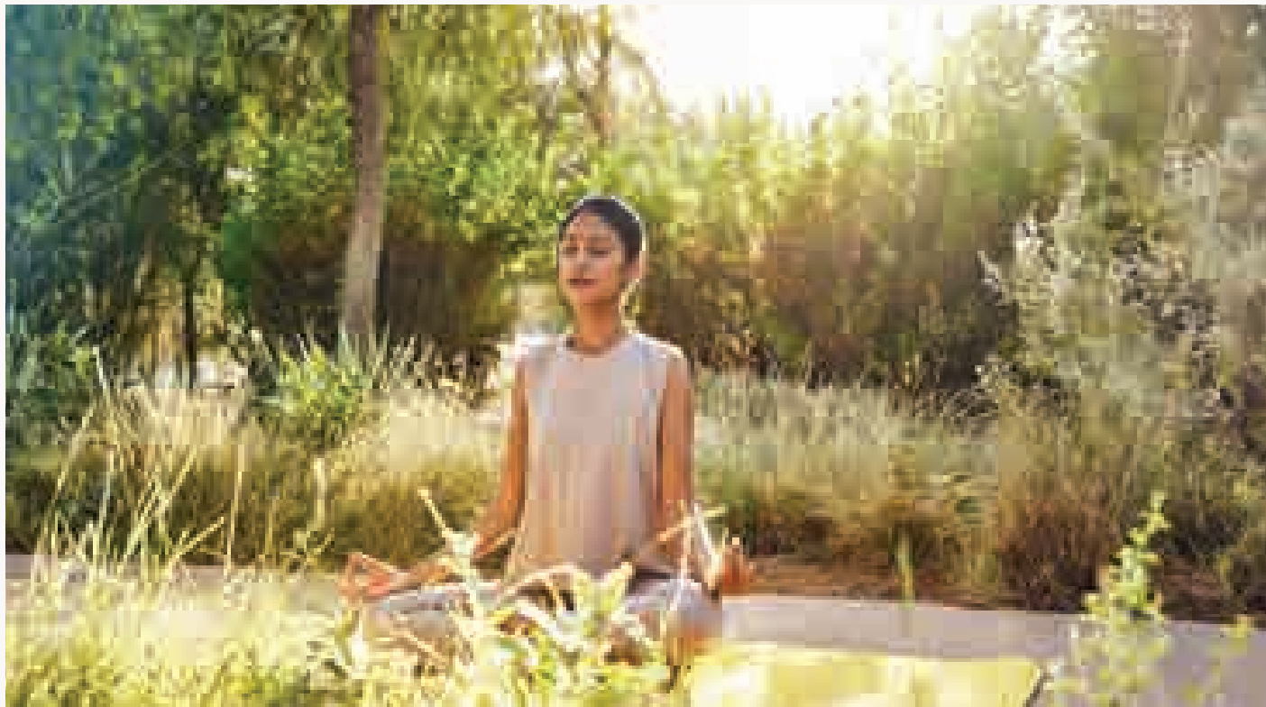
Yoga studio, health & beauty salon, spa and sauna