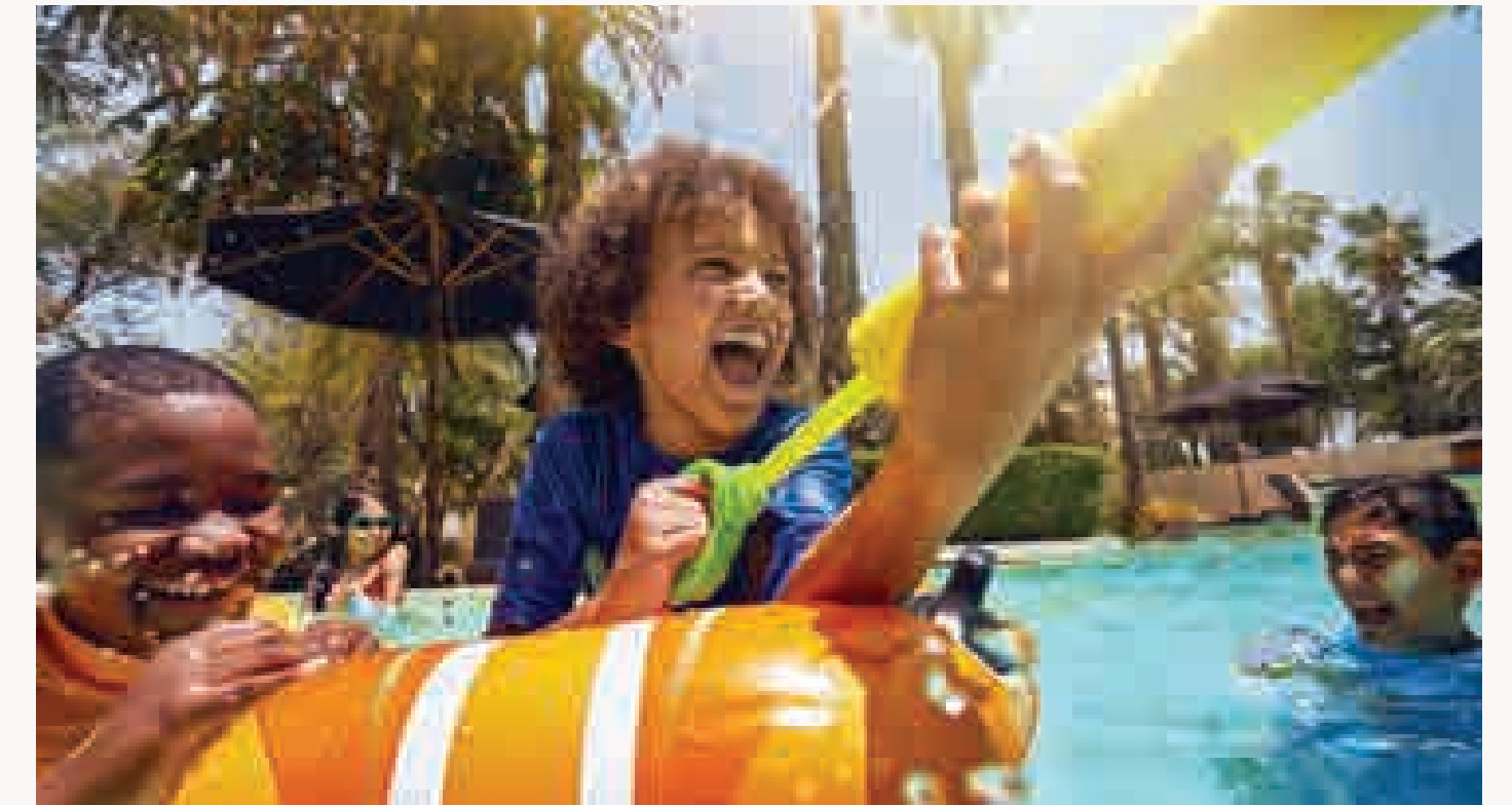
Swimming pools, splash pads and kids' play areas