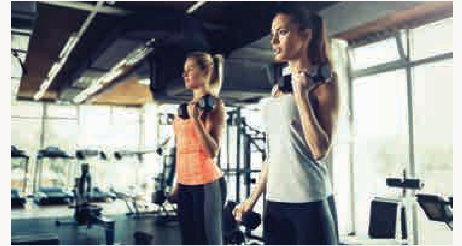
Gyms, outdoor wellness and fitness areas