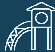
Kids Play Areas