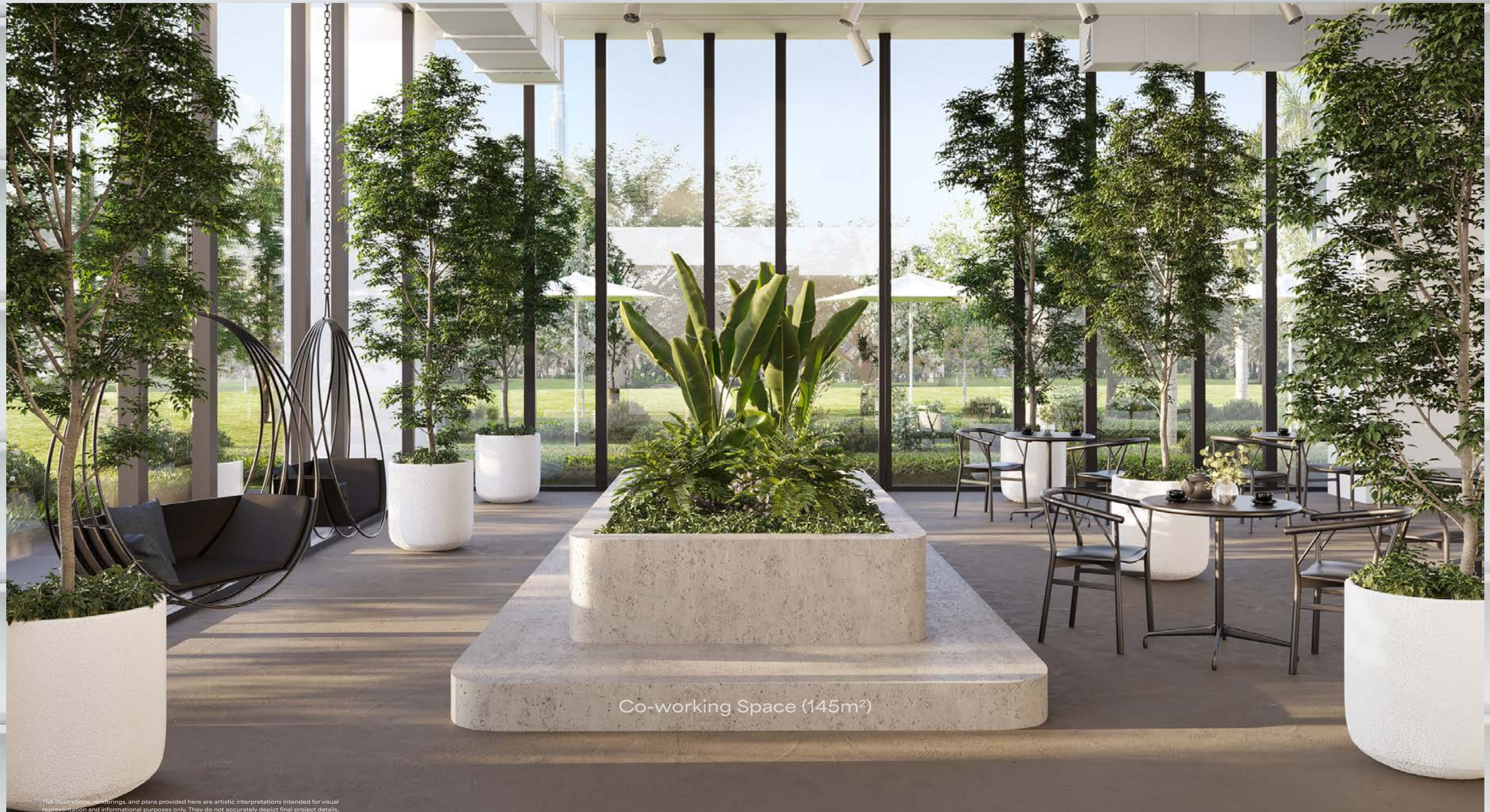
Co-working Space (145m 2 )