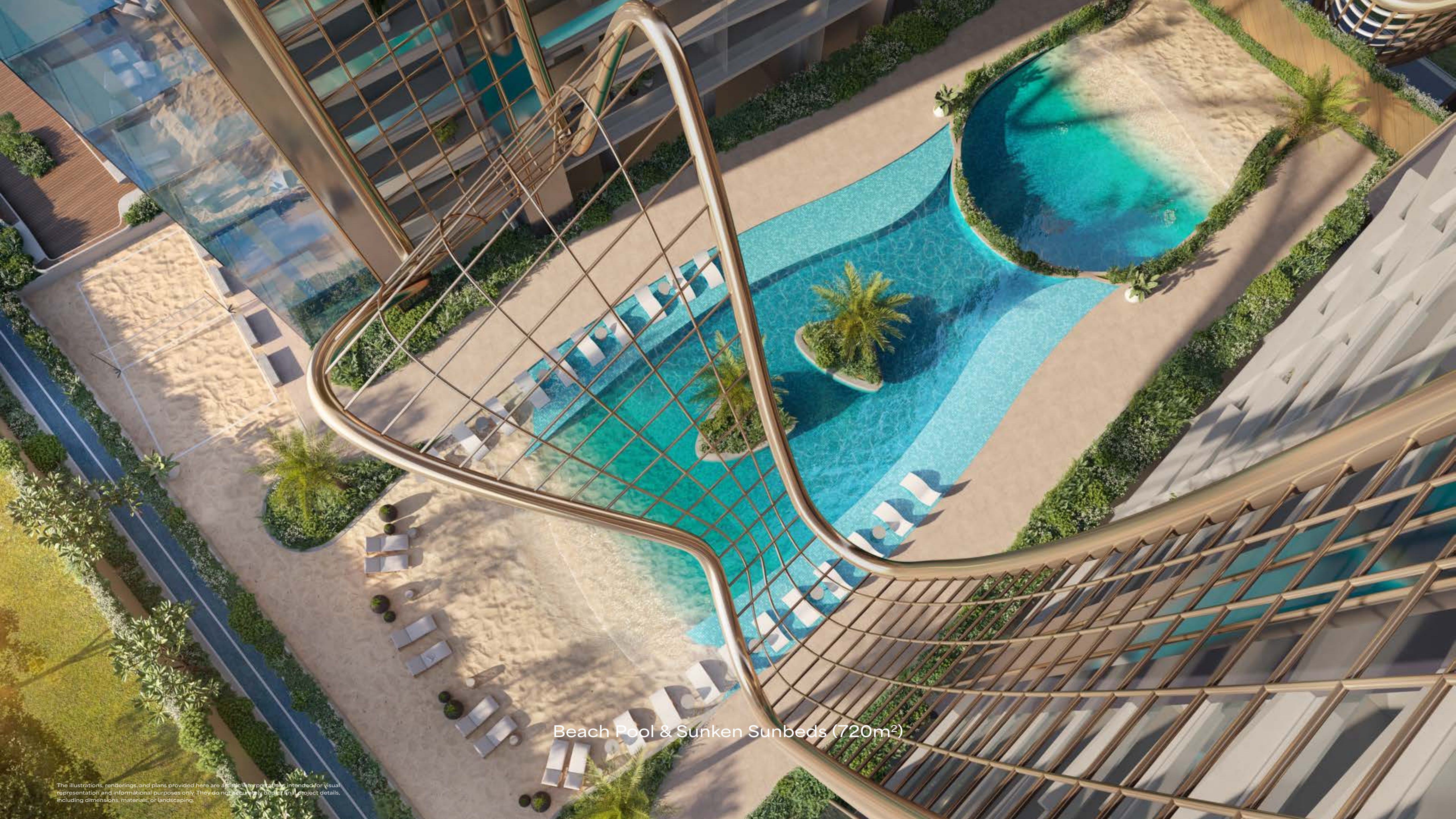
Beach Pool & Sunken Sunbeds (720m 2 )