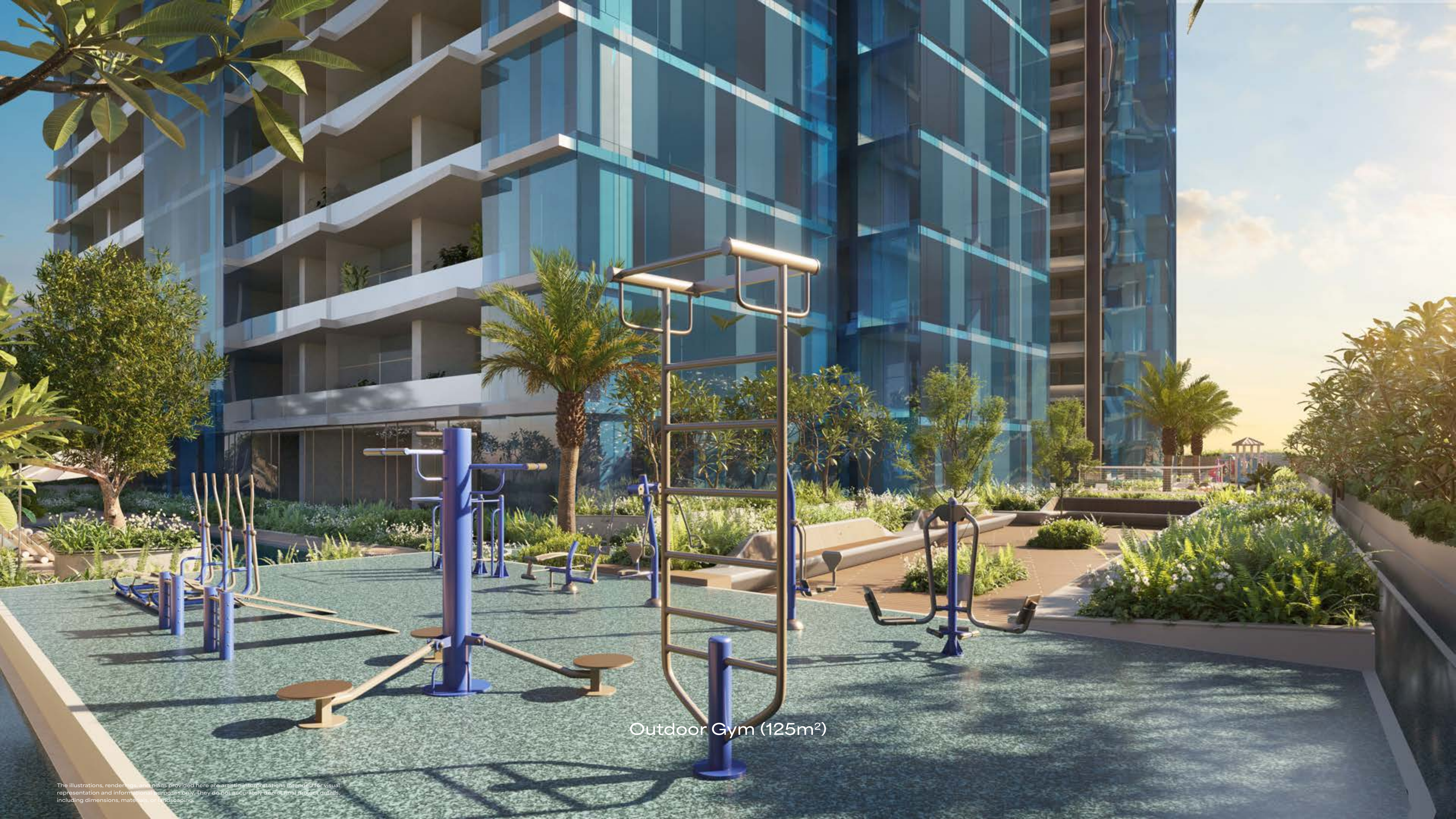
Outdoor Gym (125m 2 )