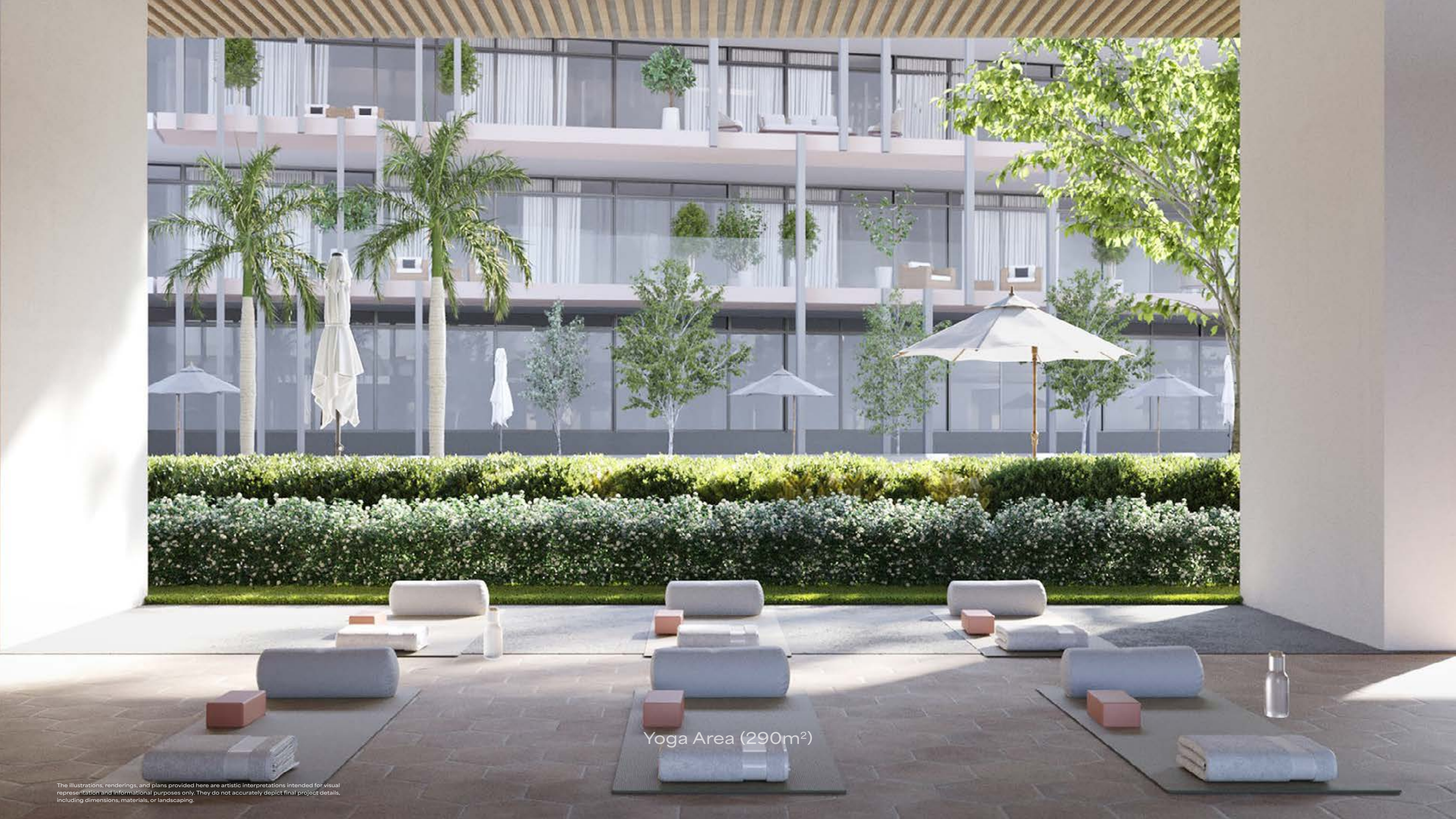
Yoga Area (290m 2 )