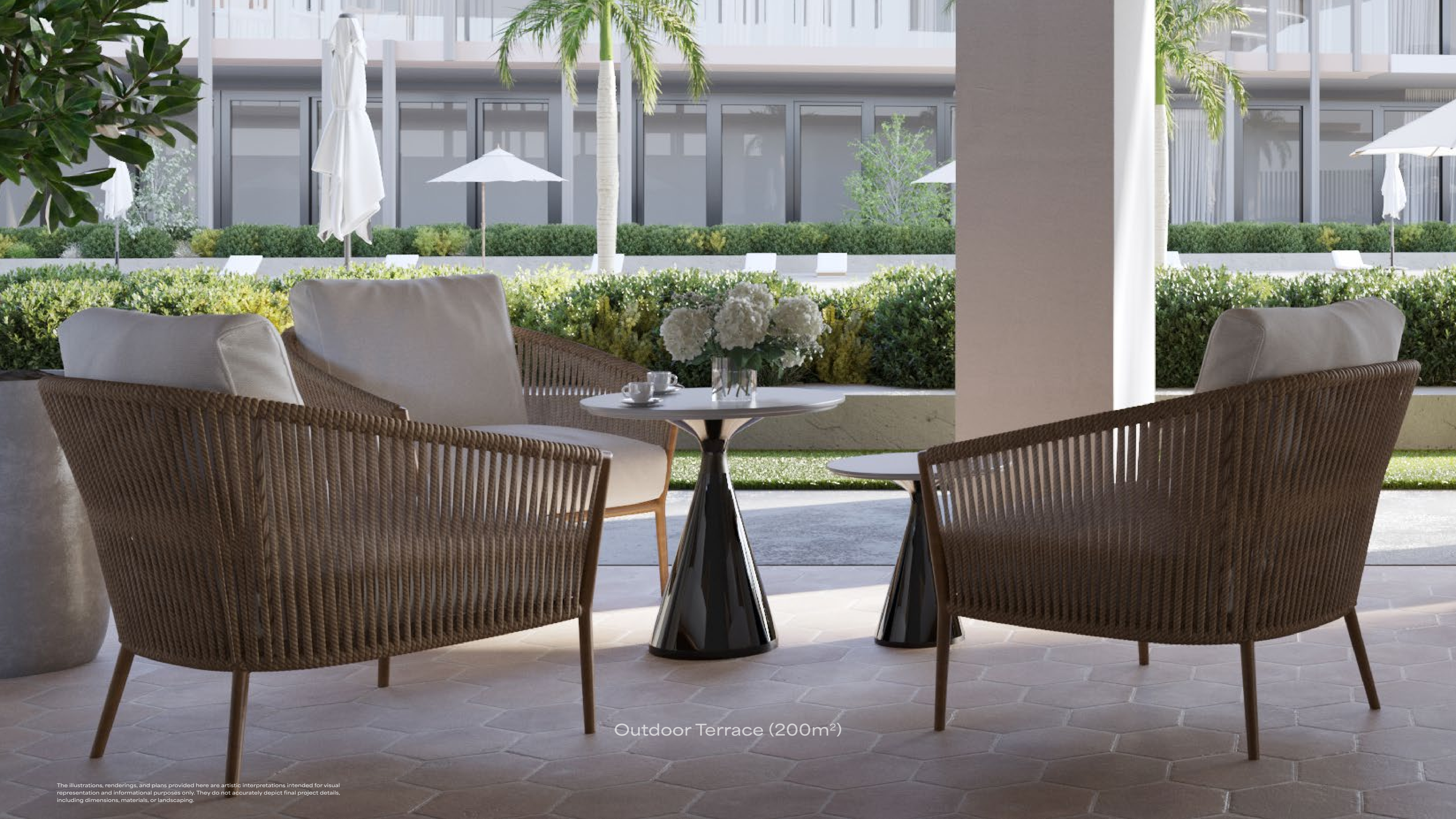
Outdoor Terrace (200m 2 )