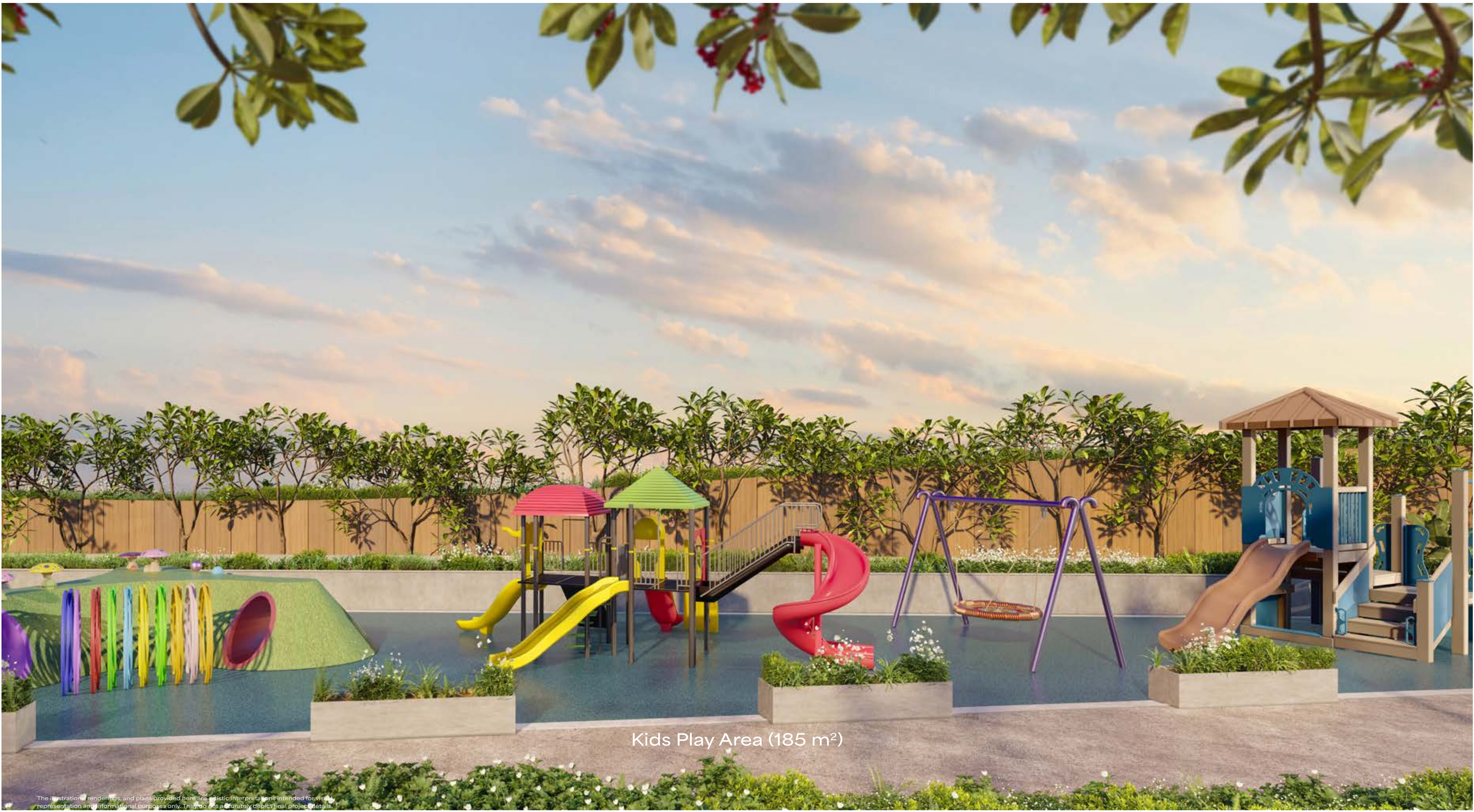
Kids Play Area (185 m 2 )