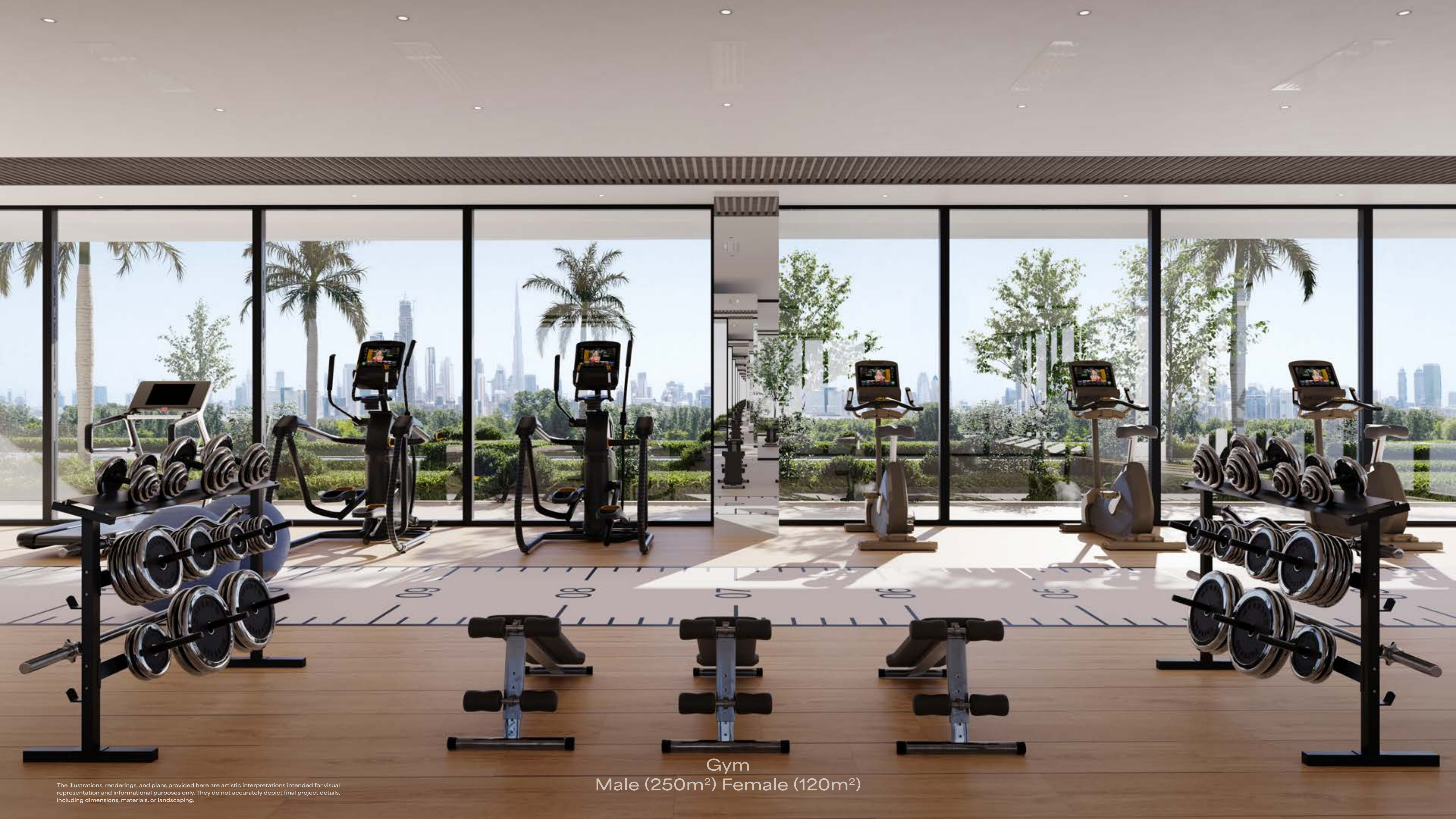
Gym Male (250m 2 ) Female (120m 2 )