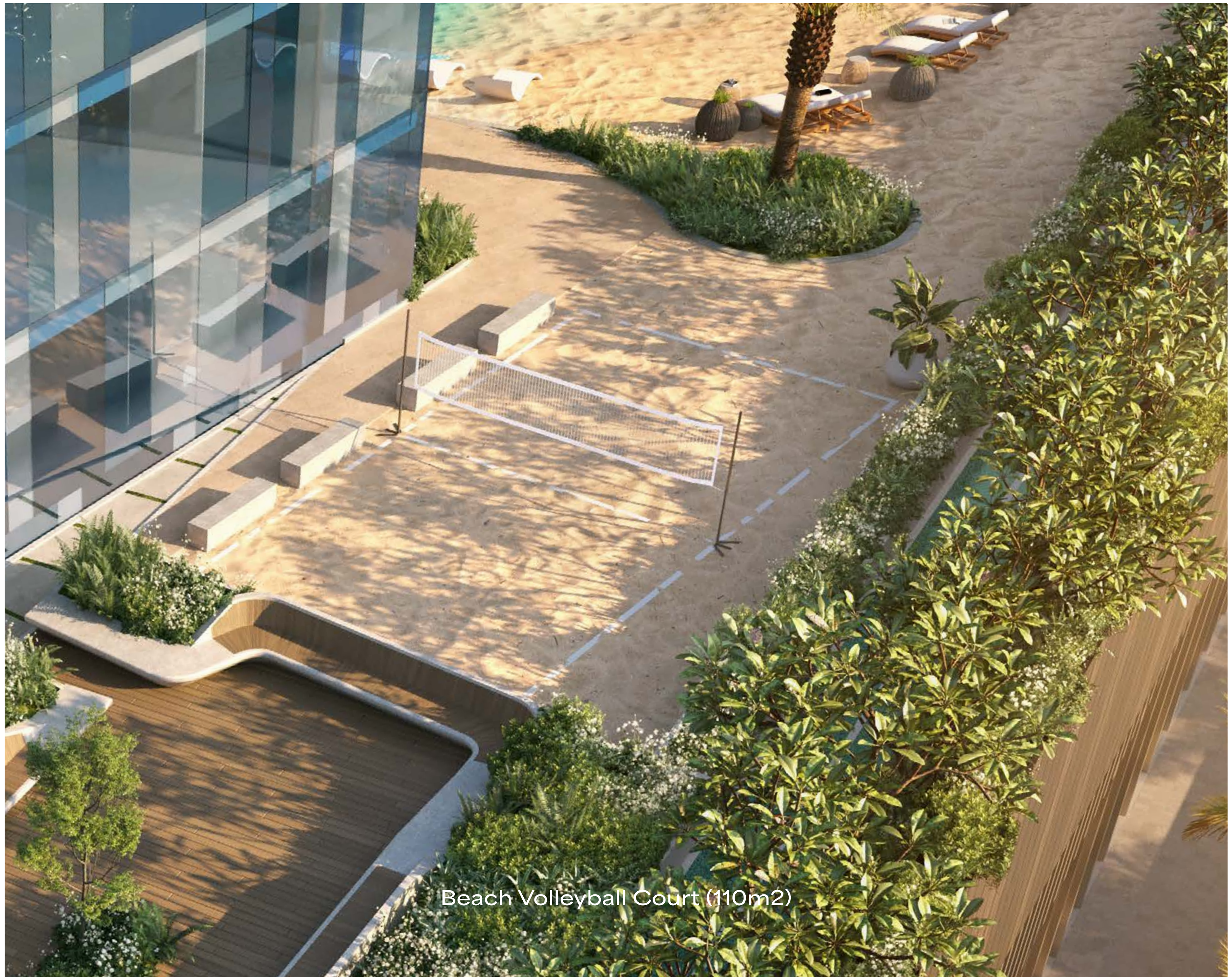
Beach Volleyball Court (110m 2 )