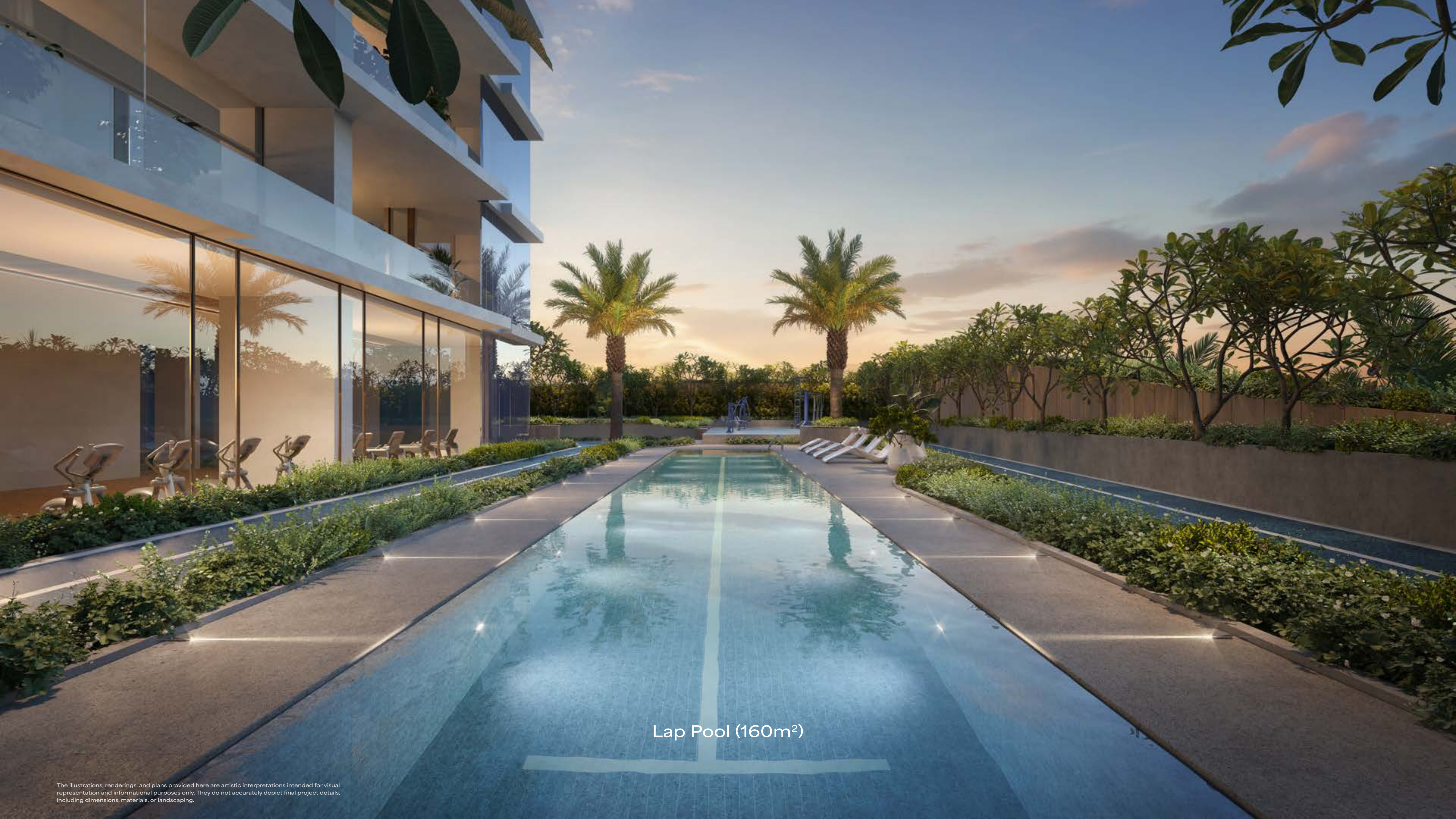
Lap Pool (160m 2 )