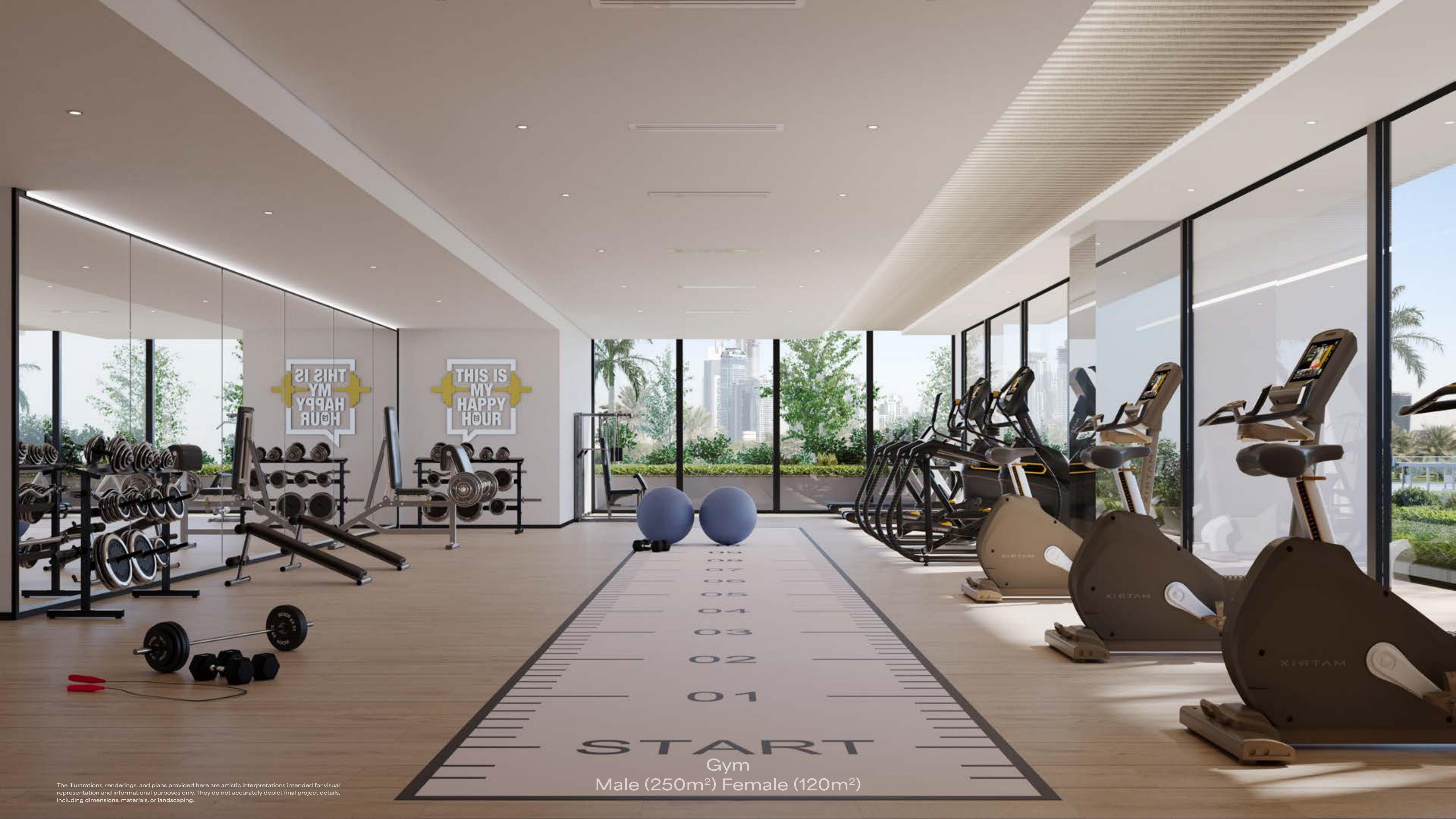
Gym Male (250m 2 ) Female (120m 2 )