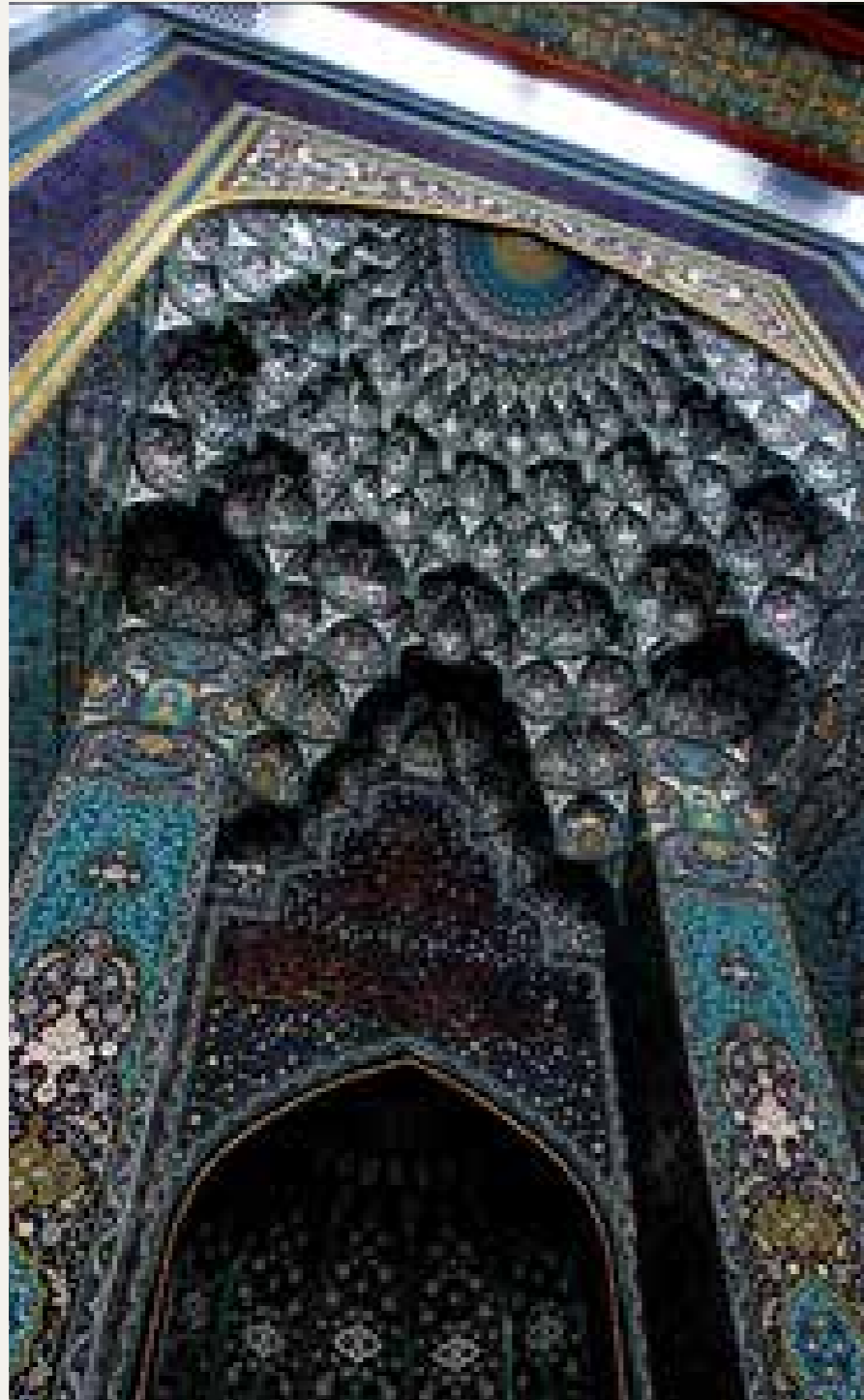
Sultan Qaboos Grand Mosque