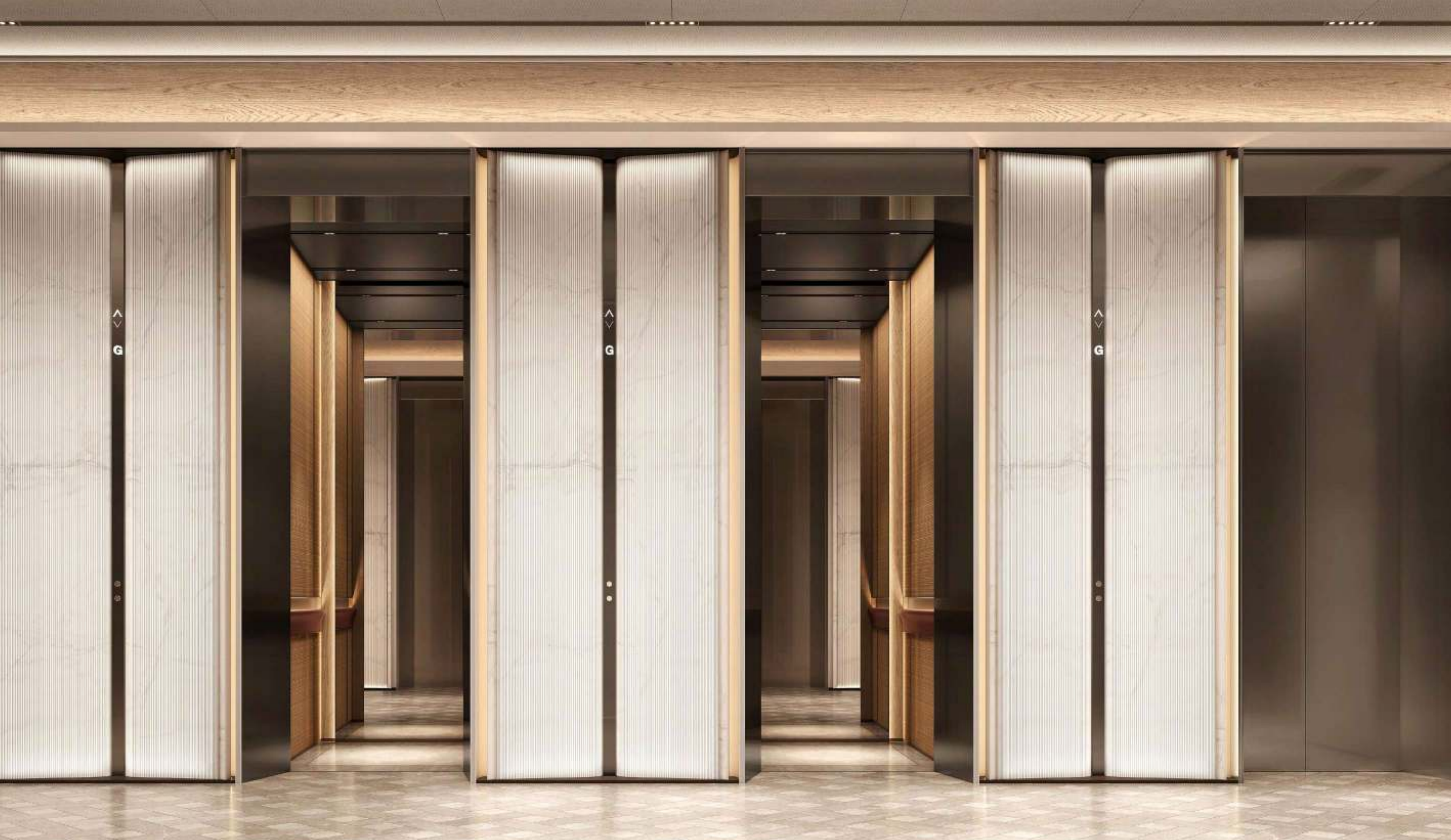
GROUND FLOOR LIFT LOBBY