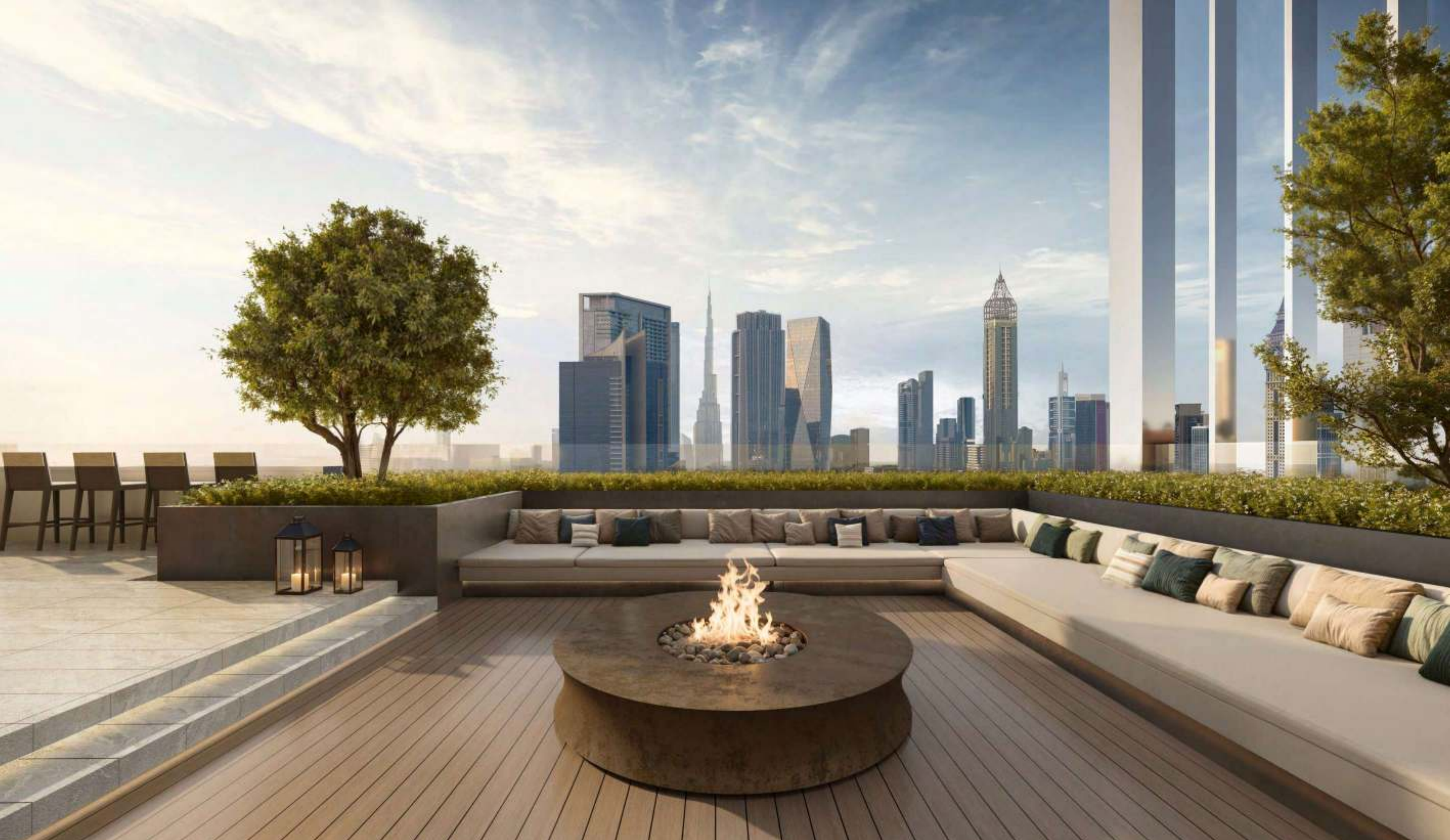
SKY TERRACE LOUNGE AREA