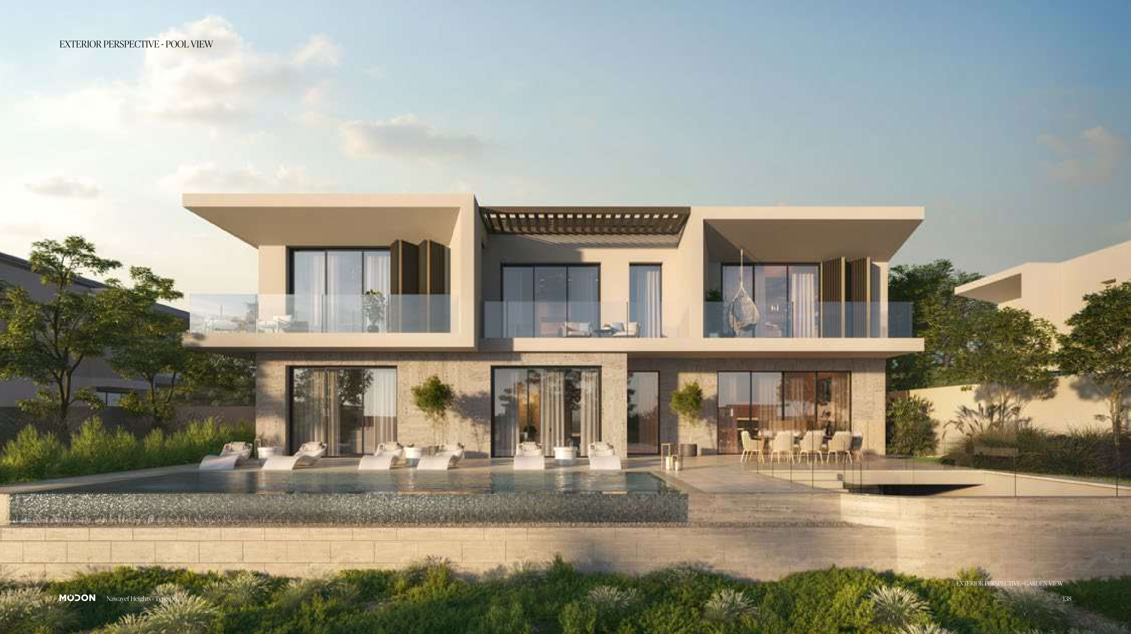
EXTERIOR PERSPECTIVE - GARDEN VIEW