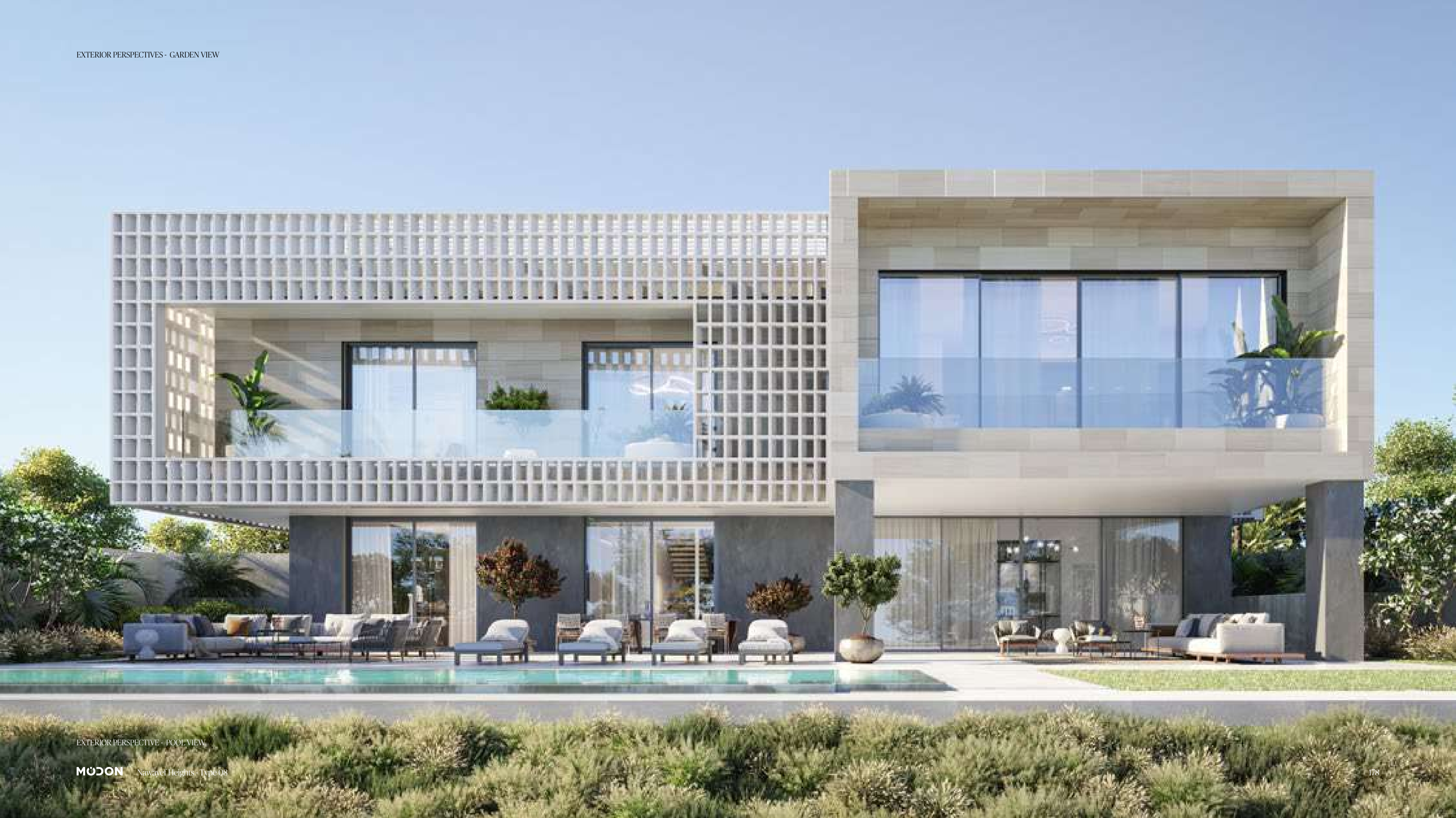
EXTERIOR PERSPECTIVE - POOL VIEW