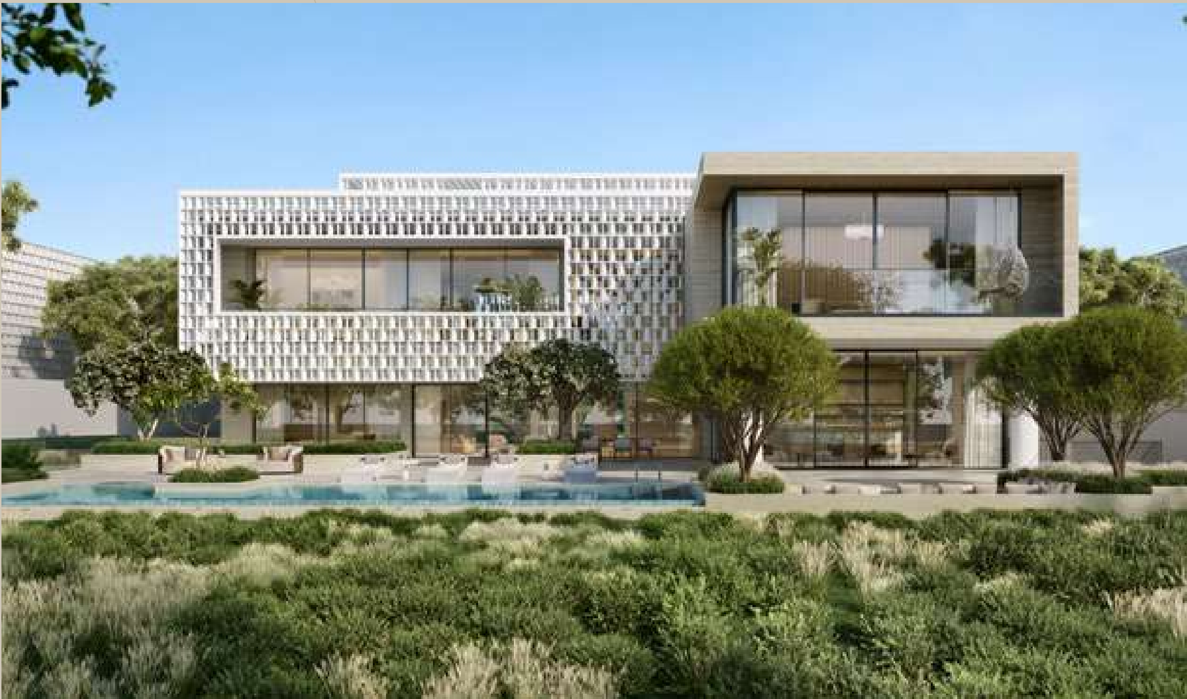
EXTERIOR PERSPECTIVE - POOL VIEW