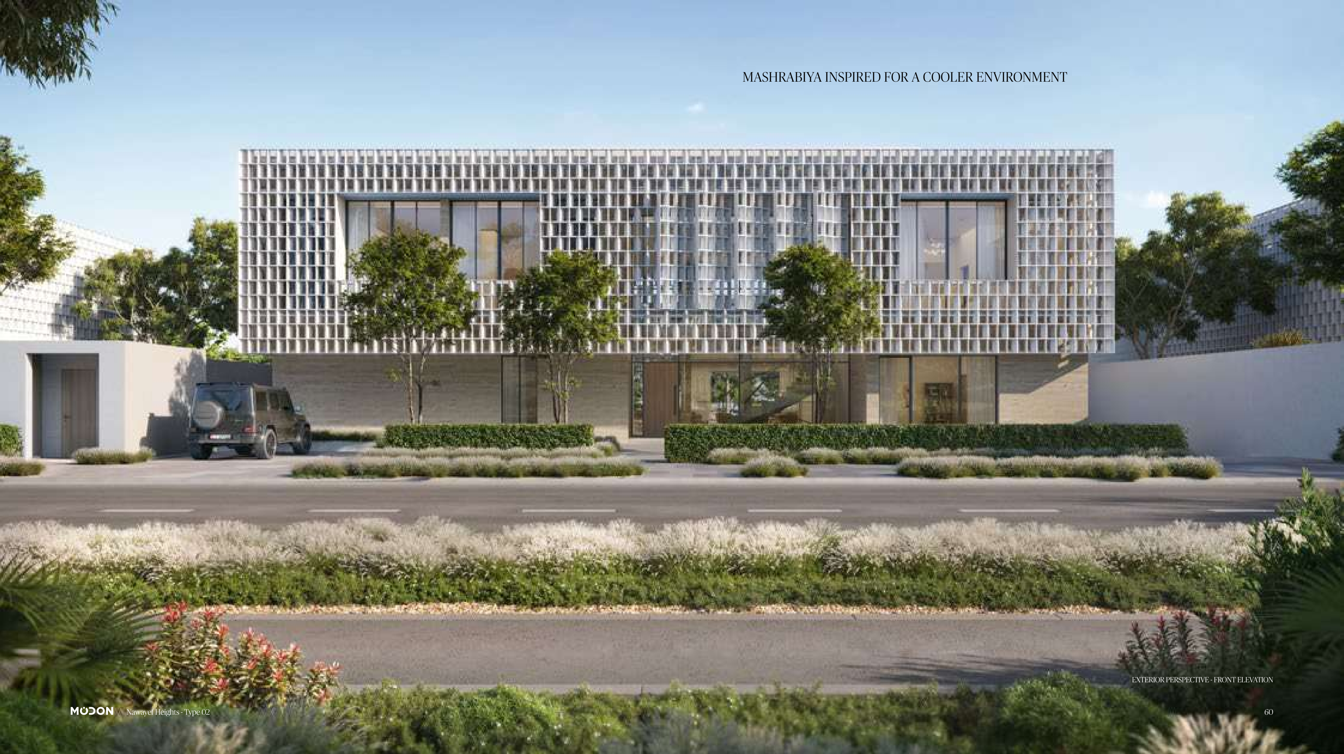
EXTERIOR PERSPECTIVE - FRONT ELEVATION