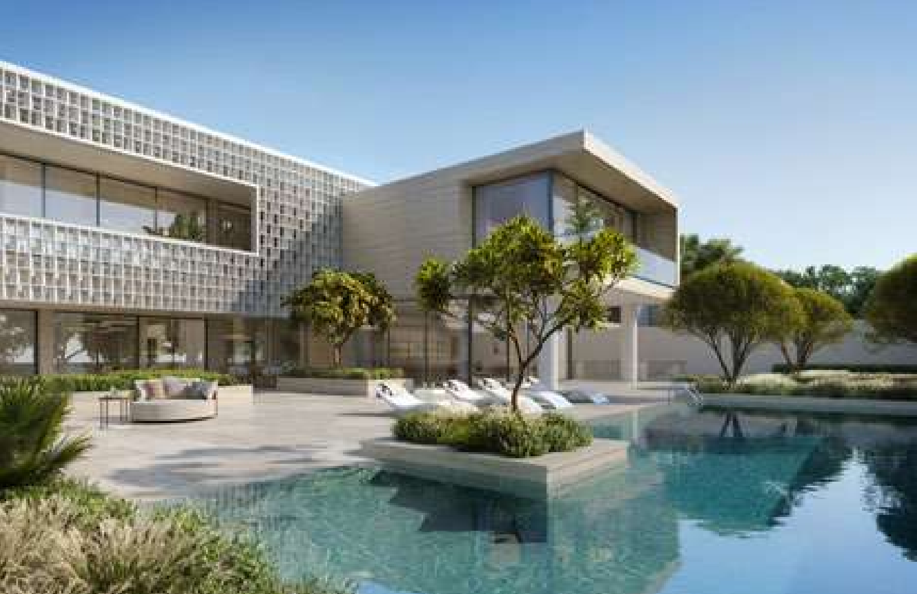
EXTERIOR PERSPECTIVE - OUTDOOR LOUNGE