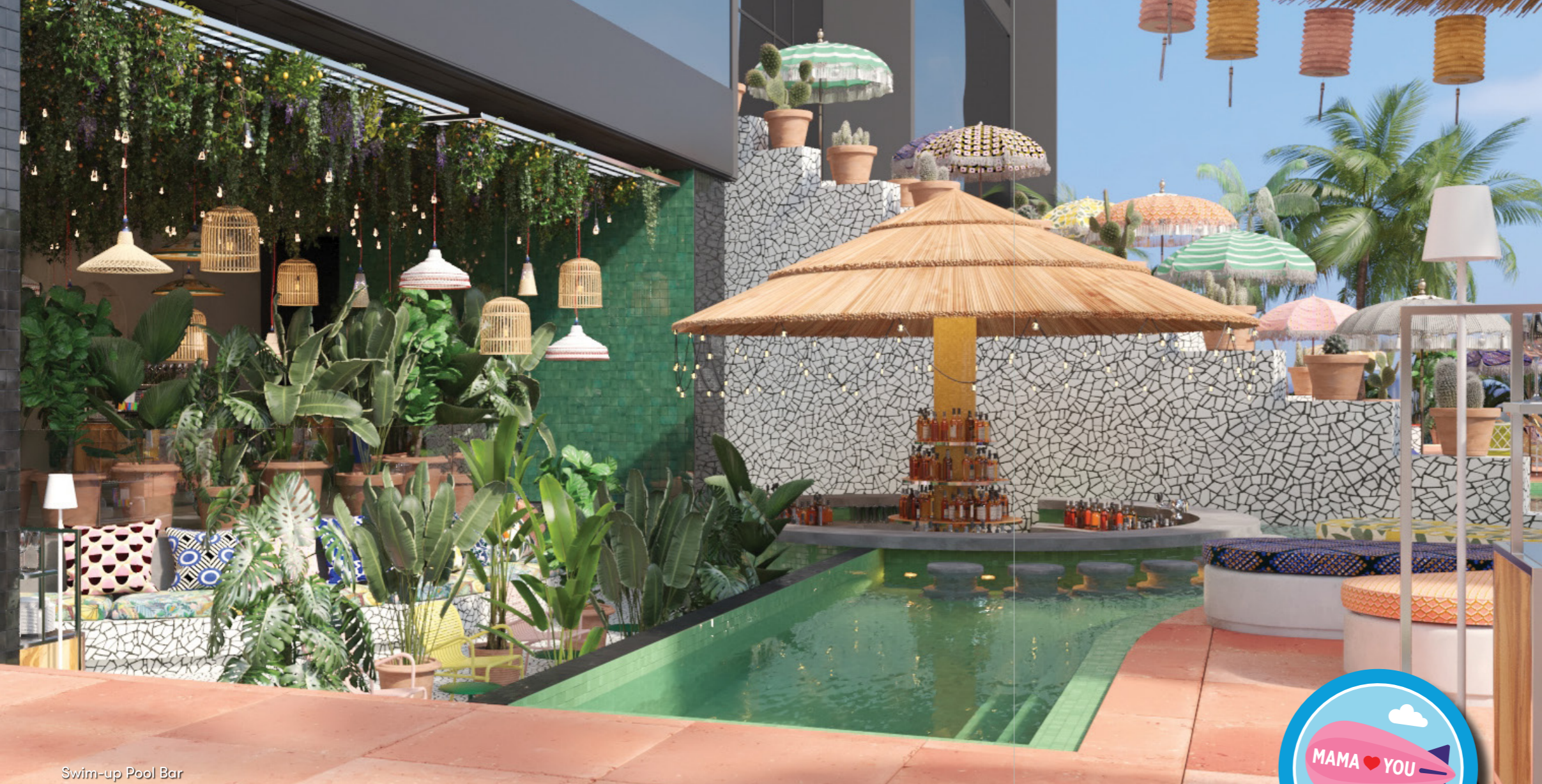
Swim-up Pool Bar