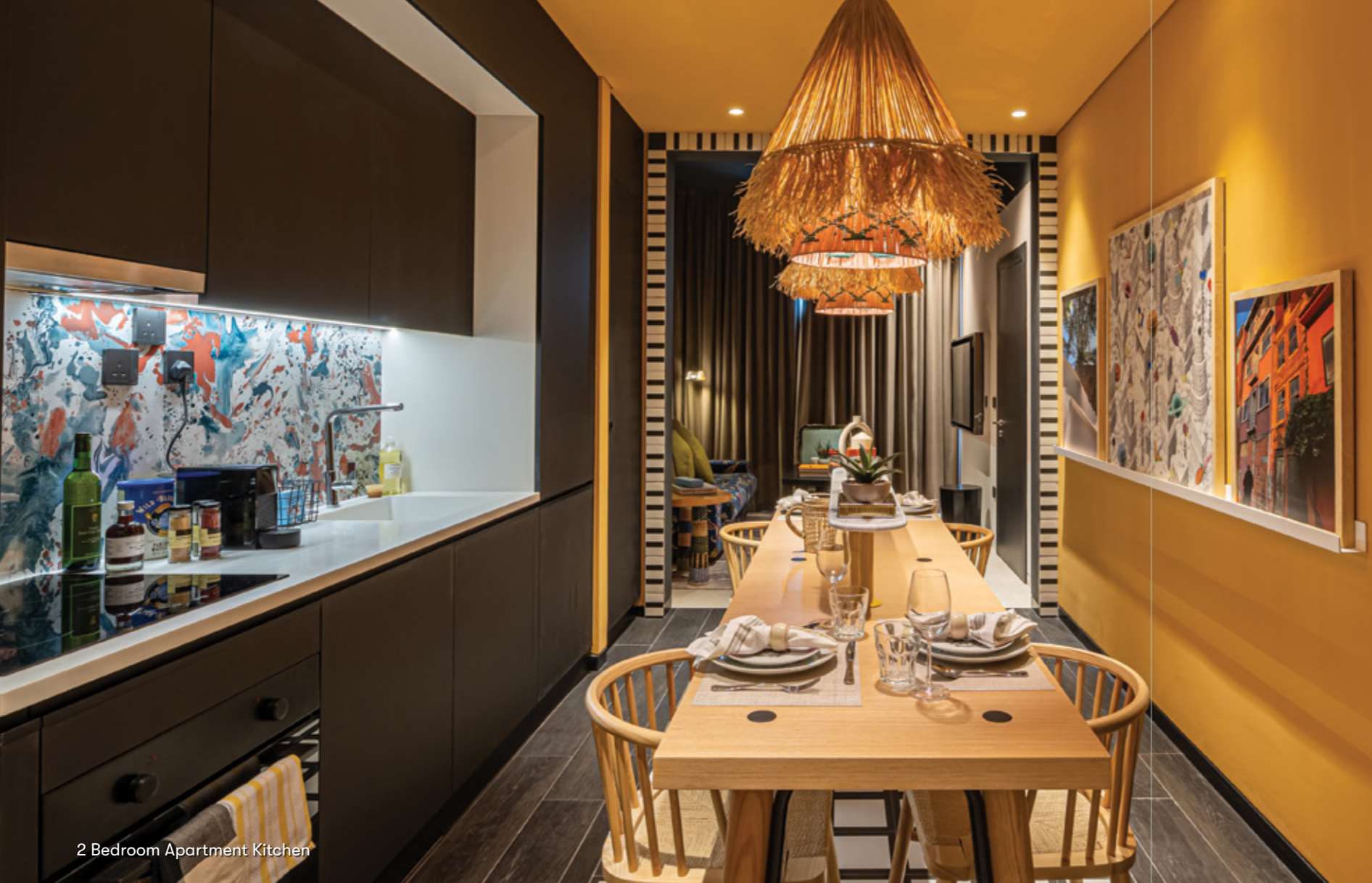
2 Bedroom Apartment Kitchen