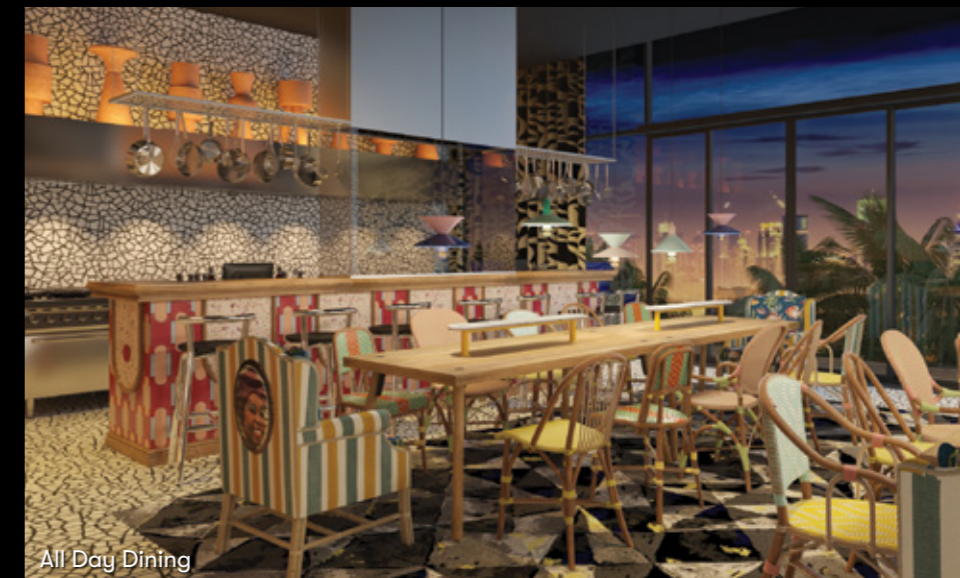
All Day Dining