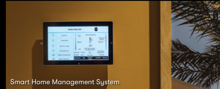
Smart Home Management System