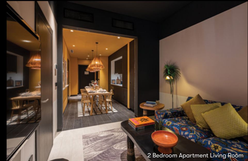
2 Bedroom Apartment Living Room

Mama Residences have been uniquely styled for the skyline around them. Every part of the building hosts art masterpieces that tell the city's story and create an urban haven where the global and the local fuse. Mosaic steps, colorful walls and eccentric hanging decorations brighten up every corner of Mama. You'll never be short on inspiration, and your home base will never be far from the lips of every mover and shaker in town.