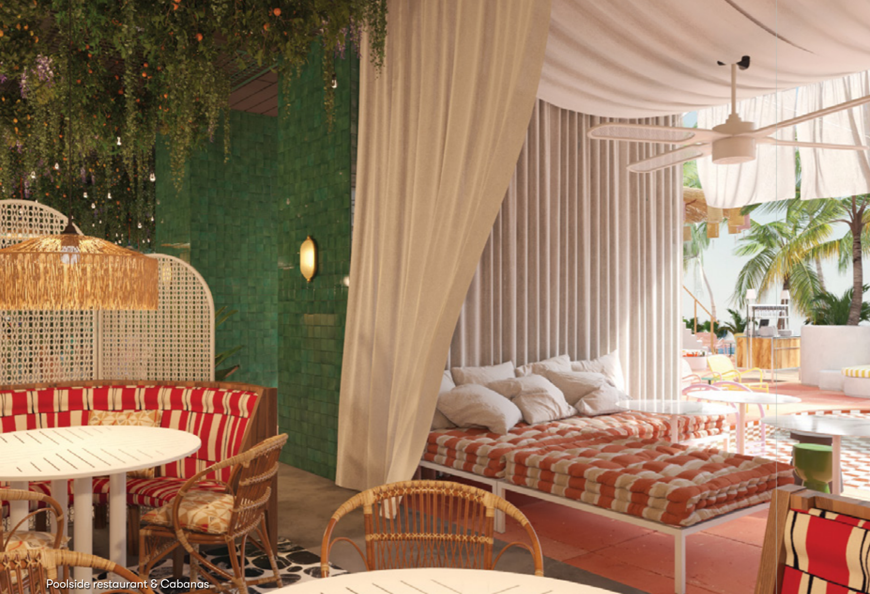
Poolside restaurant & Cabanas