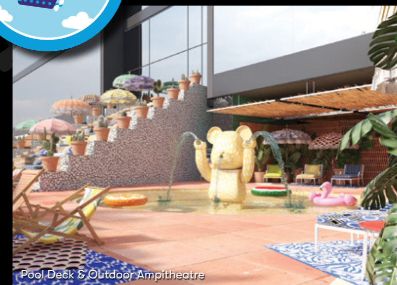
Pool Deck & Outdoor Ampitheatre