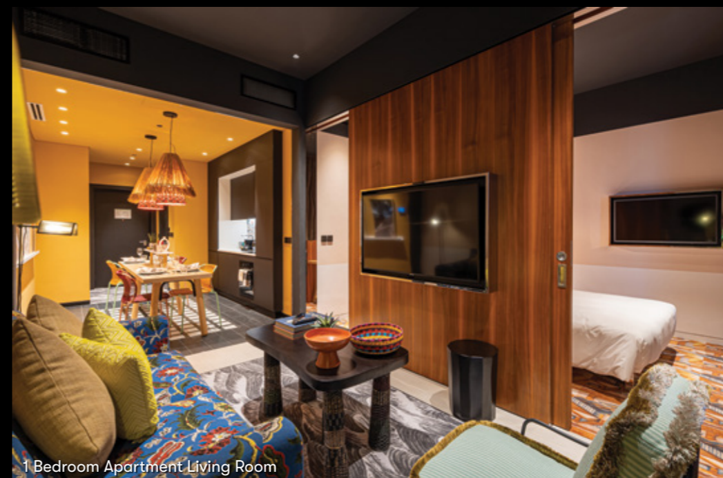
1 Bedroom Apartment Living Room

With exceptional hotel amenities and hospitality services provided by the global lifestyle hotel leader Ennismore to complete the picture, this fusion of world-class, leading hospitality and the ultimate in-home design makes this an unmatched choice in Dubai. Step inside and start living. With personalized free WiFi, a virtual concierge, a top-notch in-room entertainment system with TV and free movies on demand in every apartment... Nothing is too much to imagine for Mama!