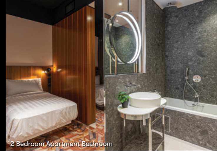
2 Bedroom Apartment Bathroom