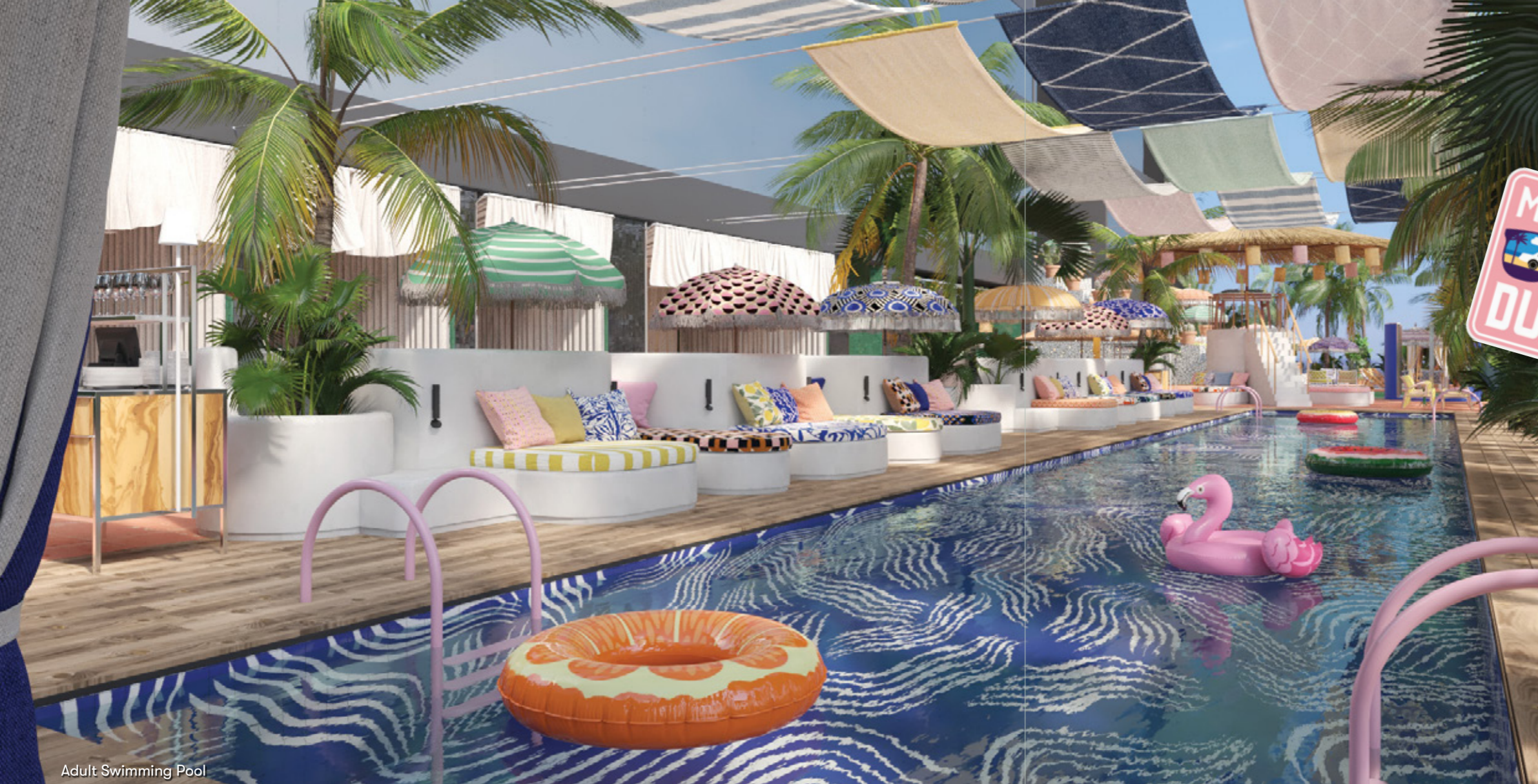
Adult Swimming Pool