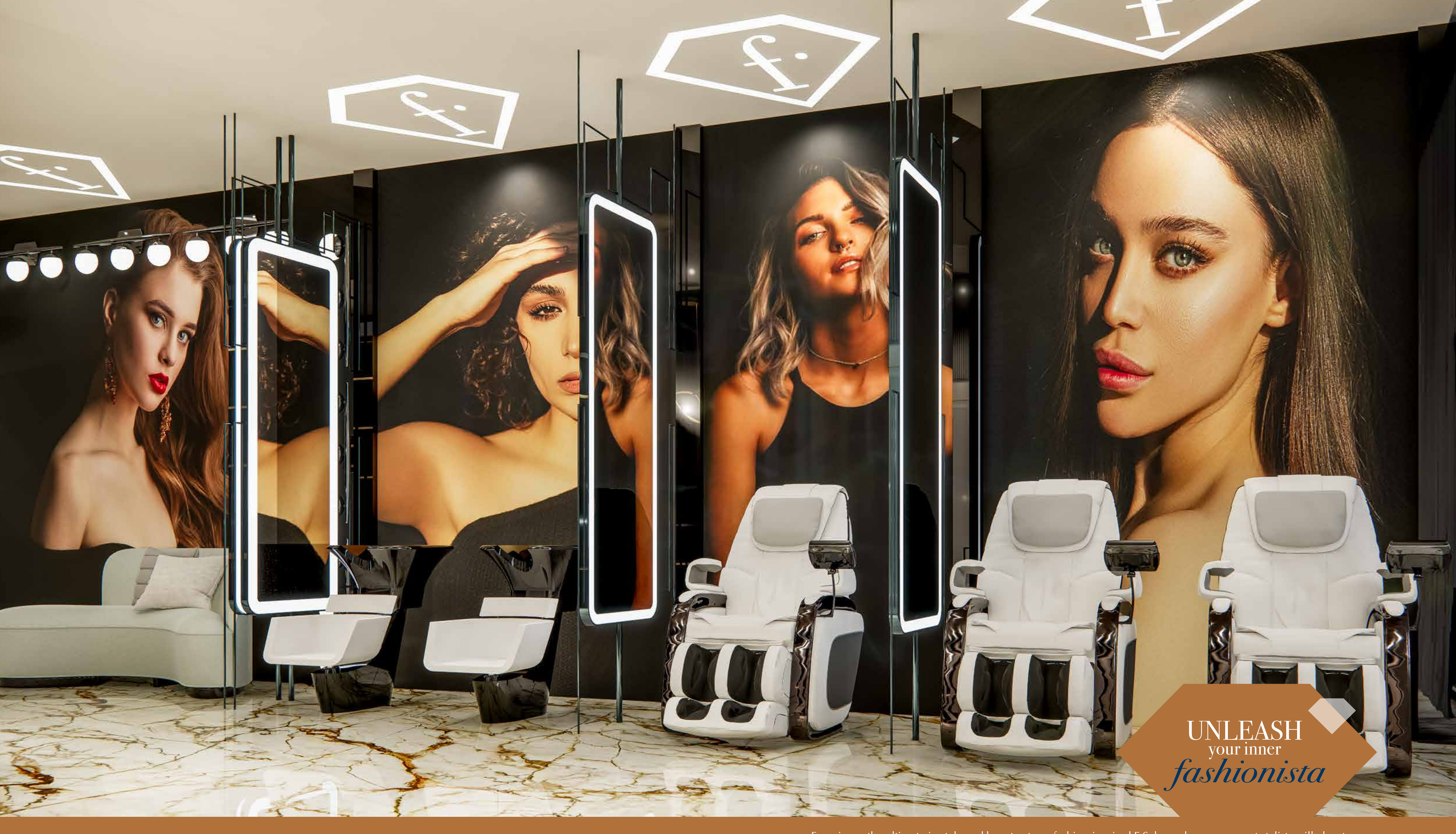
Experience the ultimate in style and beauty at our fashion-inspired F Salon, where our expert stylists will elevate your look to runway-worthy levels. From chic cuts to trendy colors, we're dedicated to helping you achieve the perfect fashion-forward style.