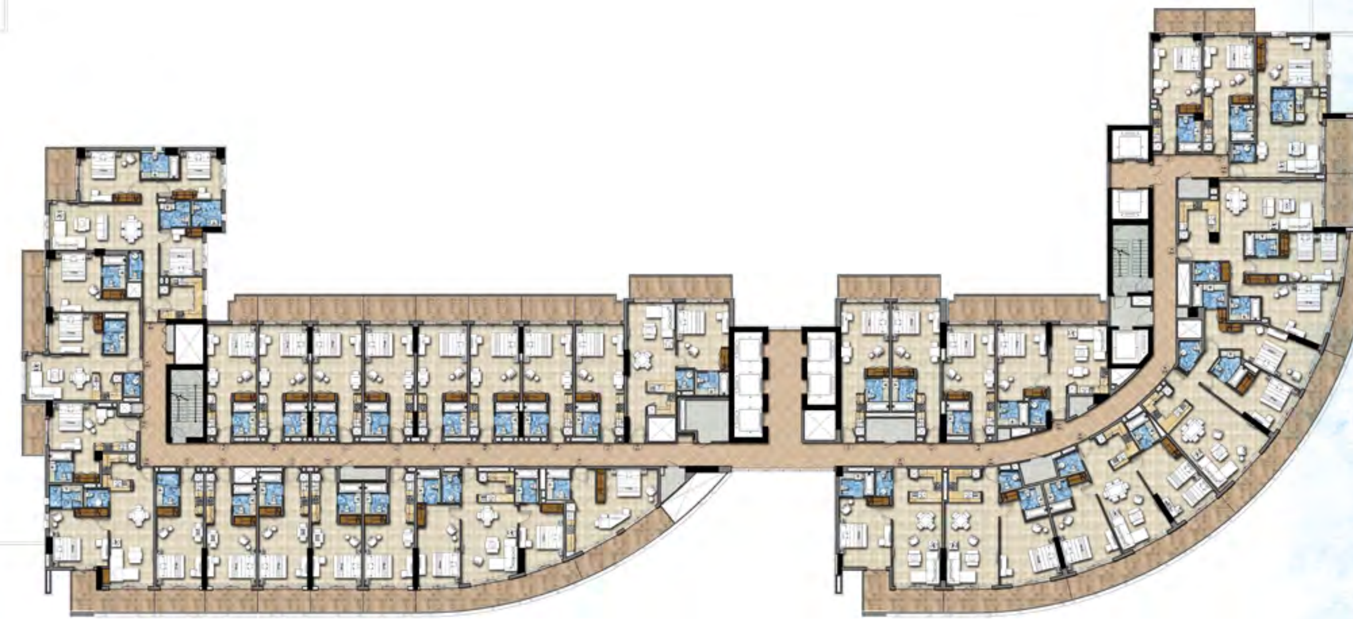
TYPICAL FLOOR PLAN Levels 9, 11, 12, 16 and 17

Disclaimer: All pictures, plans, layouts, information, data and details included in this brochure are indicative only and may change at any time up to the final 'as built' status in accordance with final designs of the project, regulatory approvals and planning permissions.