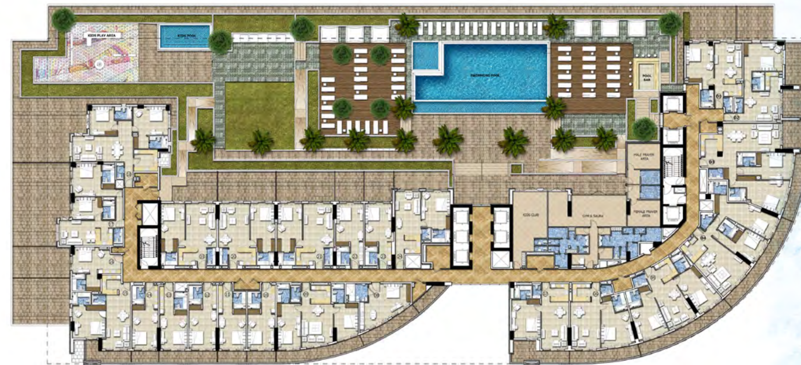
TYPICAL FLOOR PLAN Level 4 (Amenities)

Disclaimer: All pictures, plans, layouts, information, data and details included in this brochure are indicative only and may change at any time up to the final 'as built' status in accordance with final designs of the project, regulatory approvals and planning permissions.