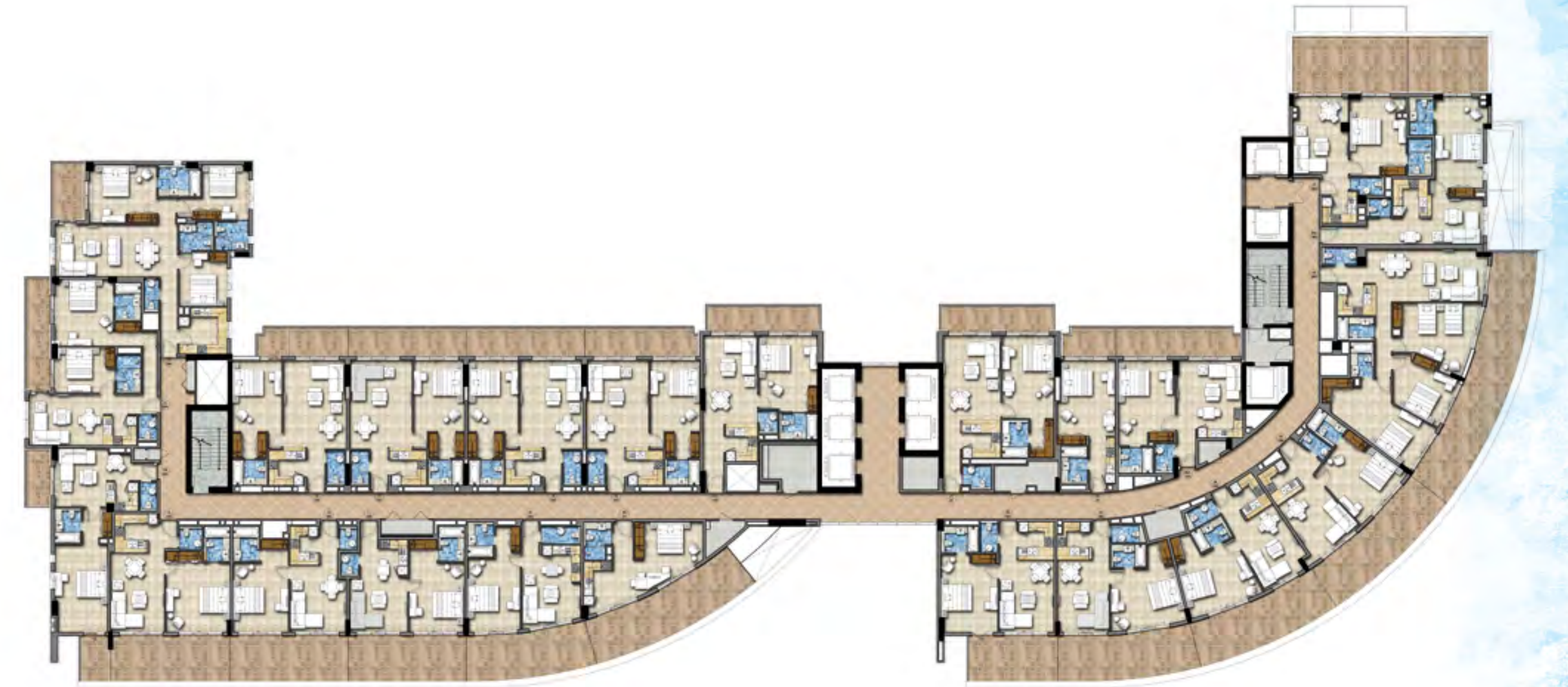
TYPICAL FLOOR PLAN Level 18

Disclaimer: All pictures, plans, layouts, information, data and details included in this brochure are indicative only and may change at any time up to the final 'as built' status in accordance with final designs of the project, regulatory approvals and planning permissions.