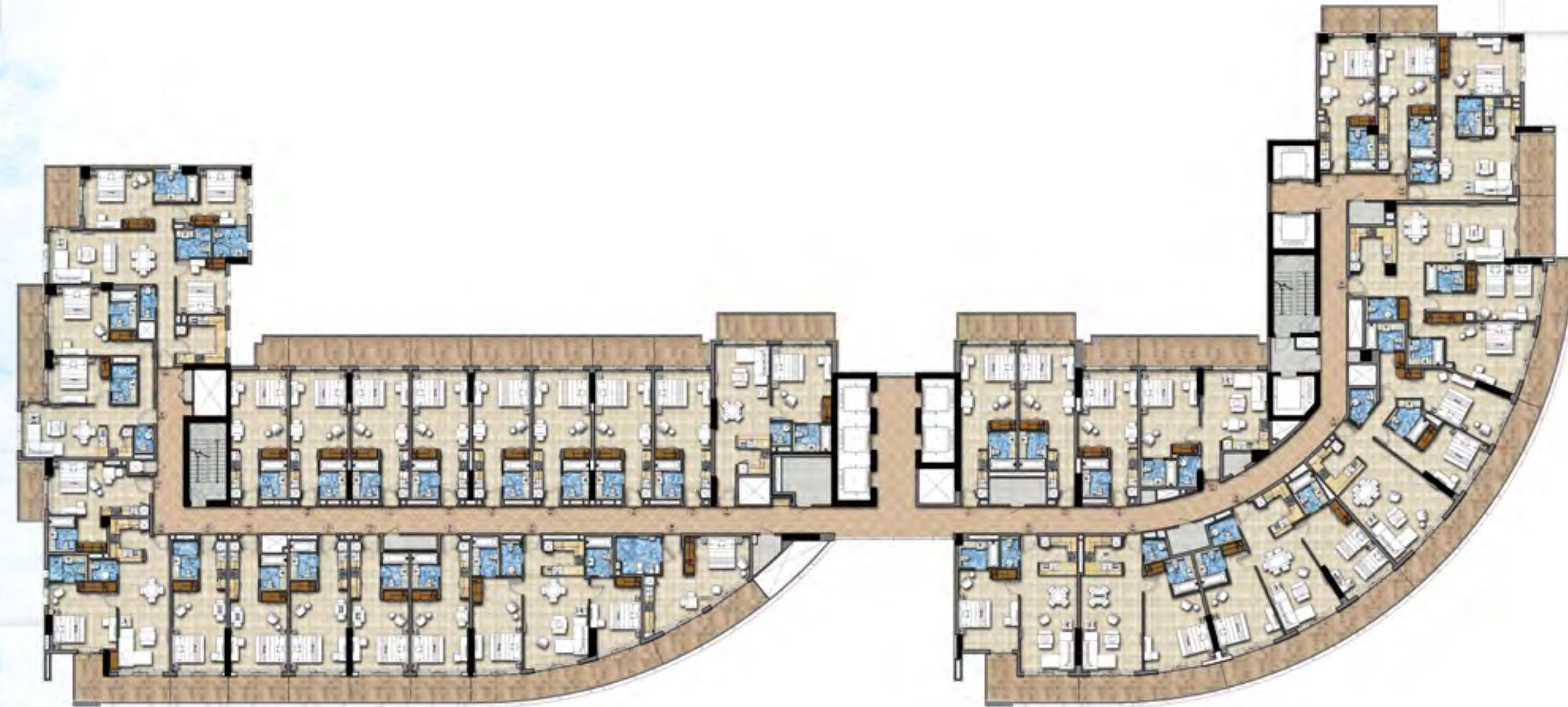
TYPICAL FLOOR PLAN Levels 5 and 6

Disclaimer: All pictures, plans, layouts, information, data and details included in this brochure are indicative only and may change at any time up to the final 'as built' status in accordance with final designs of the project, regulatory approvals and planning permissions.